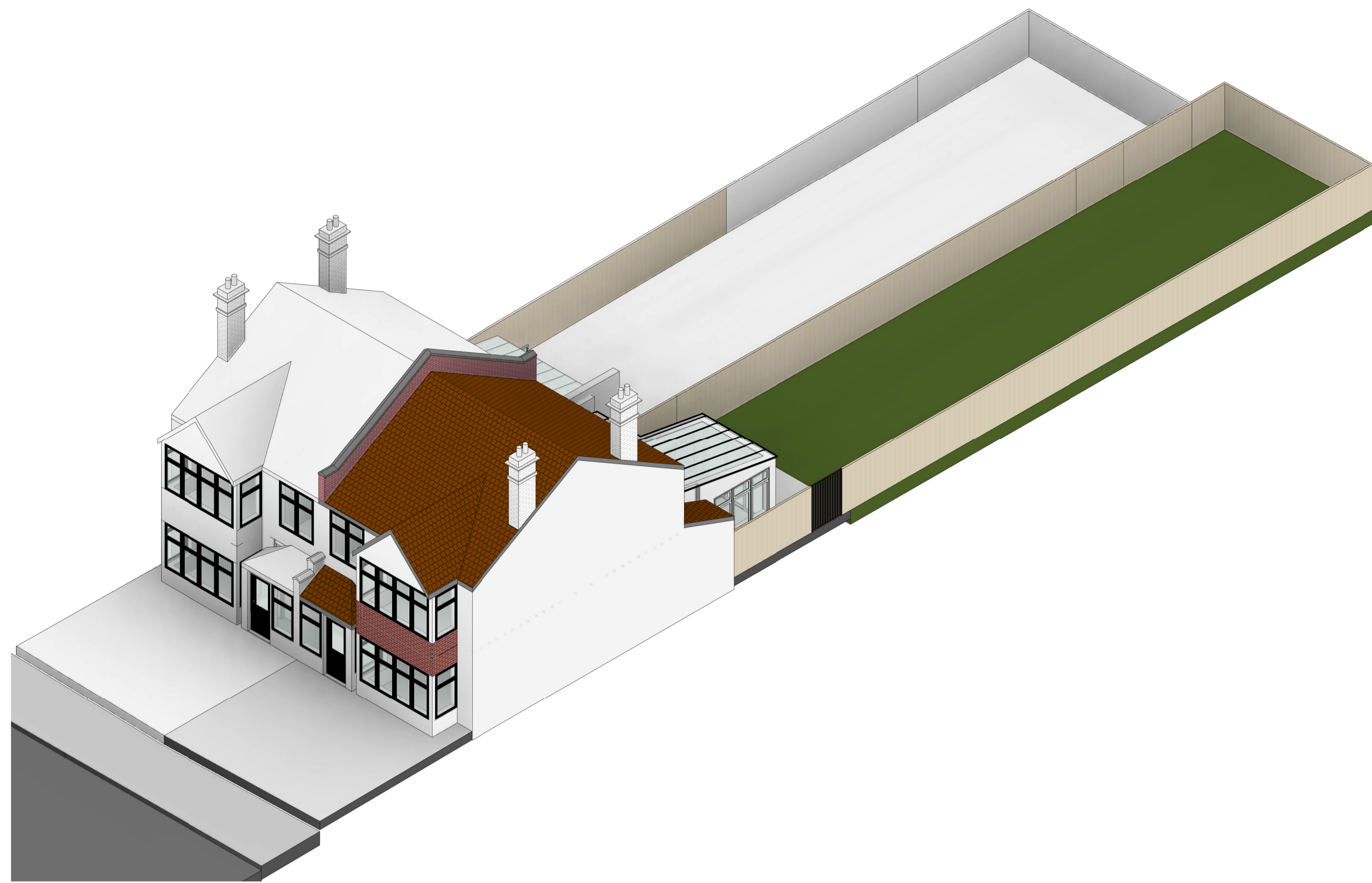
Front 3D - Existing