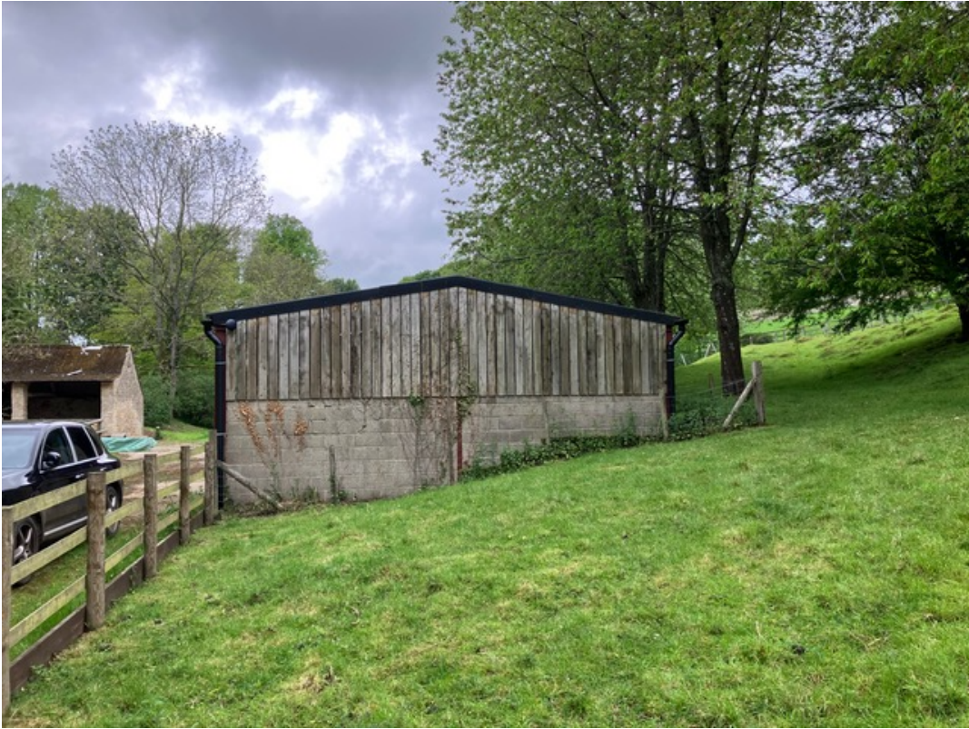
5. Gable end view of The Stables