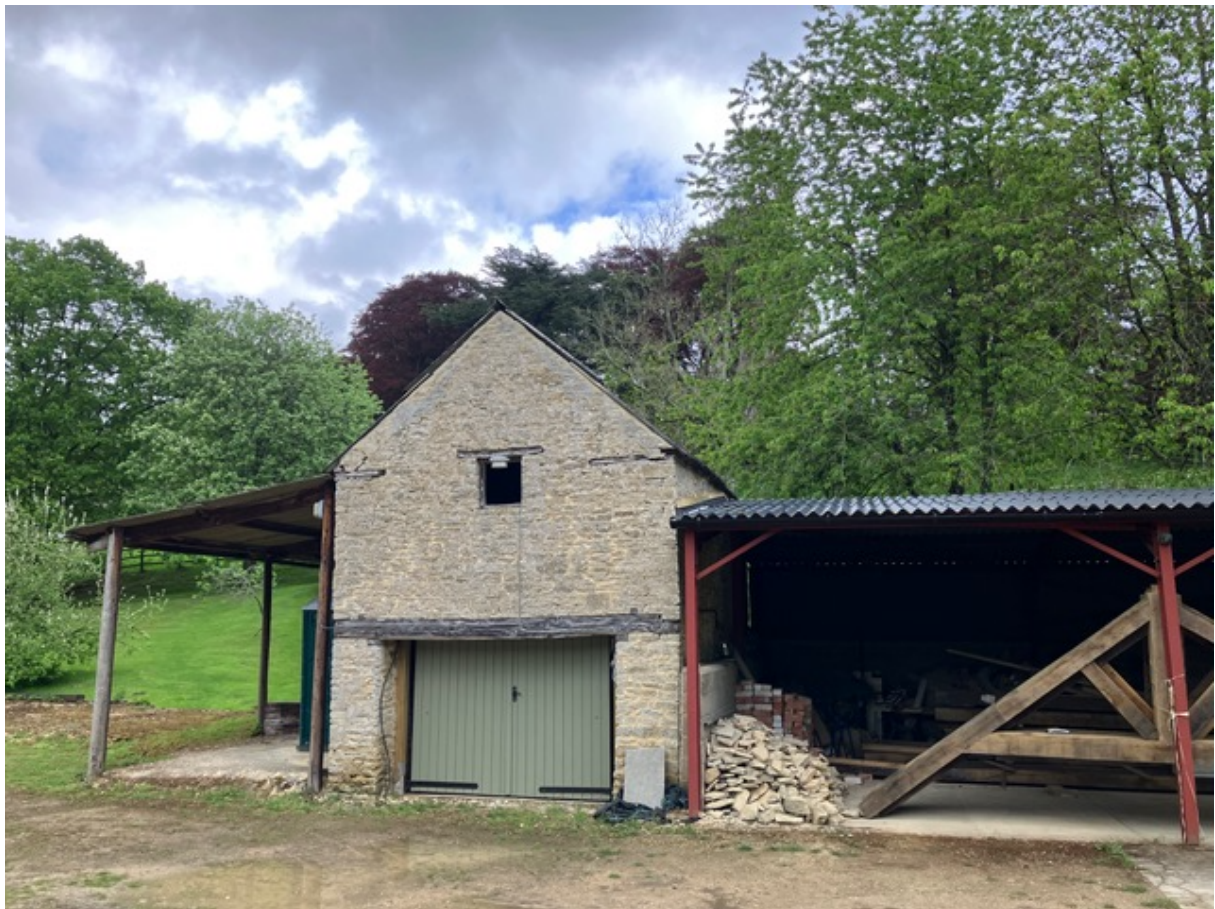
2. High Barn and adjoining lean-to and steel-framed barn

The alterations to convert High Barn and adjacent structures to a dwelling will respect the existing footprint of the buildings. It is intended to enclose the northern lean-to but this will not alter the floor area. The existing structural framework to The Stables will be retained and a new zinc-clad roof and walls faced with timber boarding will be fitted. High Barn will be re-roofed using Cardinal slates to match Lower Barn and new glazed screen and windows fitted within existing openings. The lean-to will be enclosed with natural stone walls to match the attached High Barn and the existing roof will be replaced with a zinc-clad structure to reflect the new roof over The Stables. Screens and windows will be anodised aluminium framed and conform with current energy saving practices.