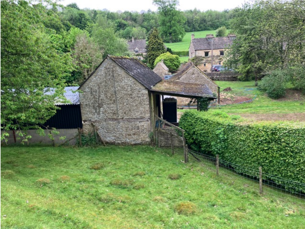
3. High Barn with Home Farm Barn beyond