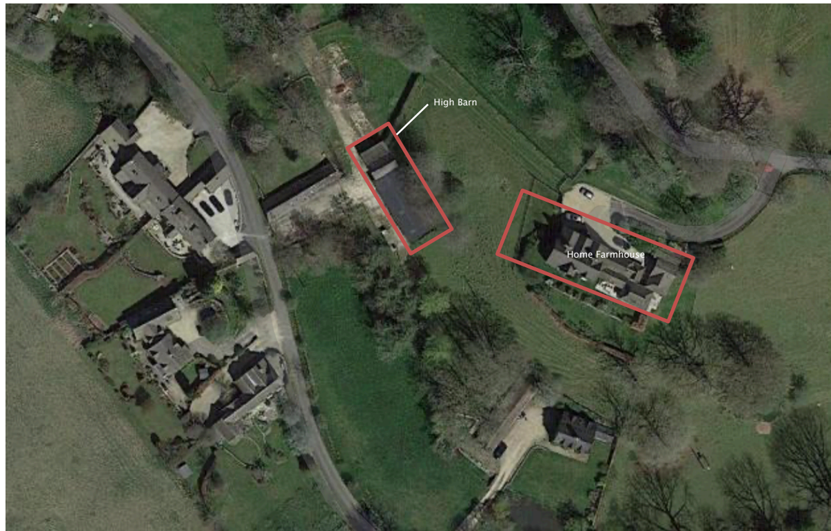
1. Home Farmhouse, Bagendon

The buildings to be converted comprise a stone cart shed (known as High Barn) with a covered lean-to shelter to the north and a modern steel framed open-sided barn to the south (The Stables). This barn has been used as a tack room and stabling for horses (15/01749/FUL). These buildings originally formed part of a small complex of farm buildings remote from the main farm house which included a single storey building known as Lower Barn. The conversion of this building to a dwelling was granted planning consent in 2004 (03/02092/FUL) and the project achieved completion in 2023. It is now known as Home Farm Barn. As part of the proposal to convert Lower Barn into residential use High Barn was included in the application as an annex to the main dwelling. However, it has been decided that the best use of the remaining range of buildings is to convert them into a separate residential unit.