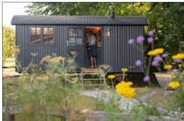
TYPICAL SHEPHERDS HUT IMAGE