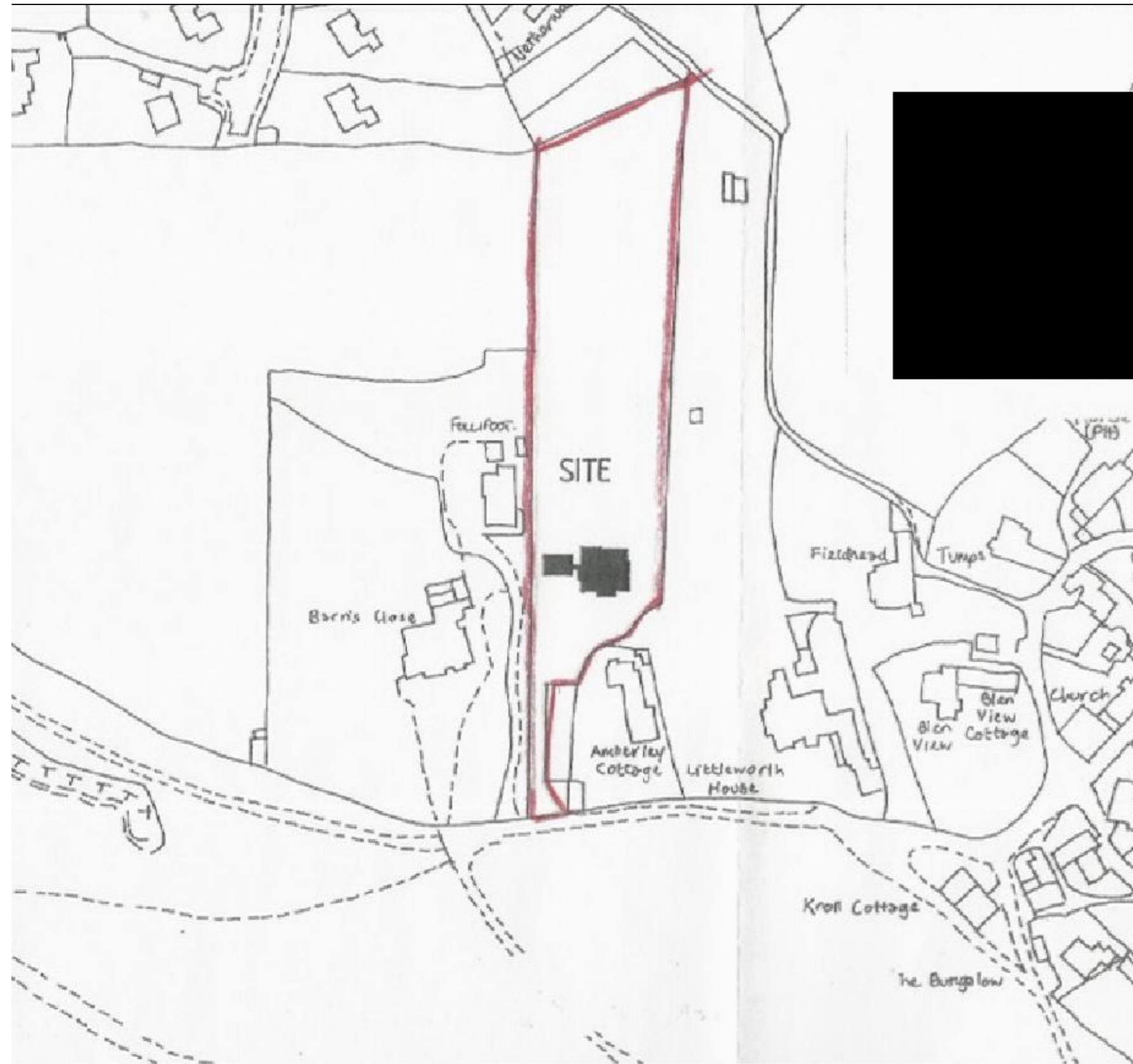
LOCATION PLAN 1;1250