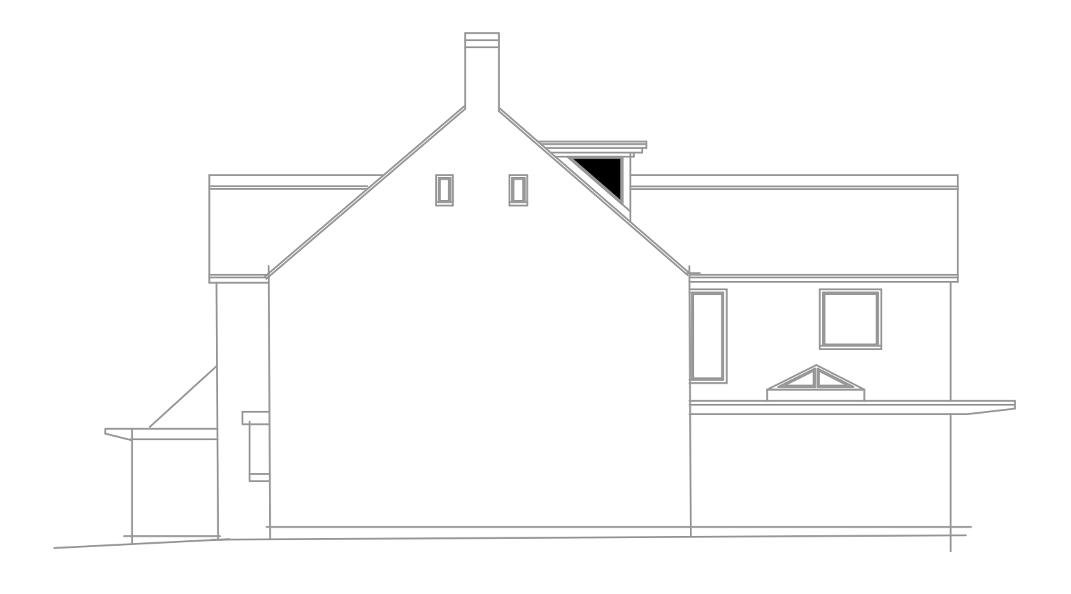
SIDE ELEVATION - PROP