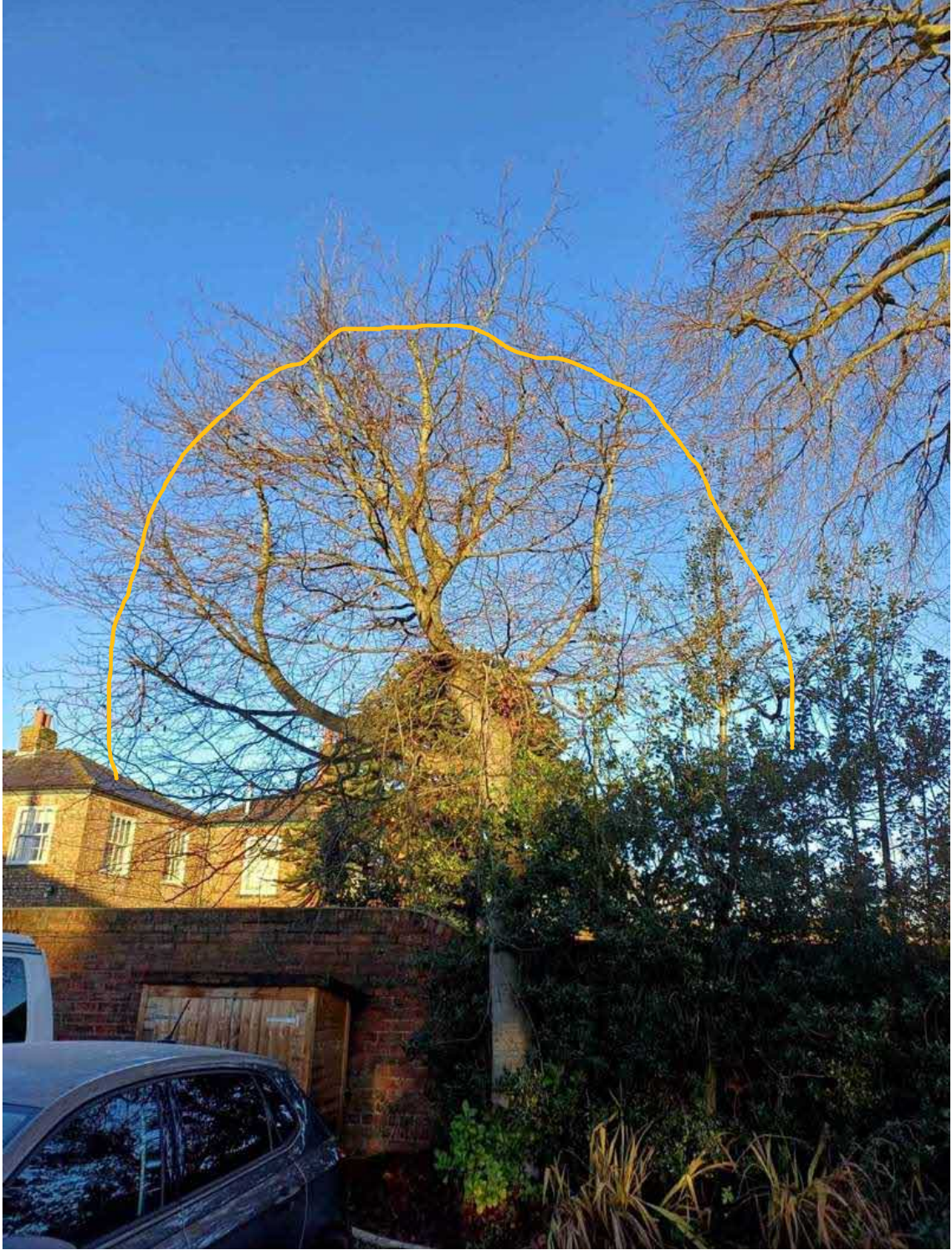
Beech tree to be reduced by 25%