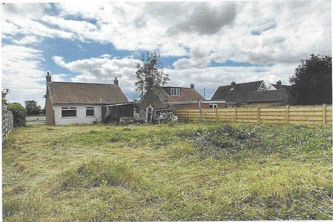
REAR GARDEN AND REAR ELEVATION - LOOKING SOUTH