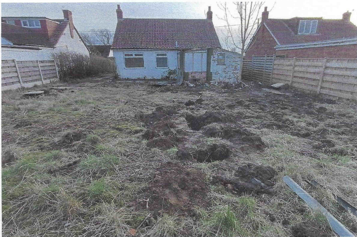
REAR GARDEN AND REAR ELEVATION - LOOKING SOUTH