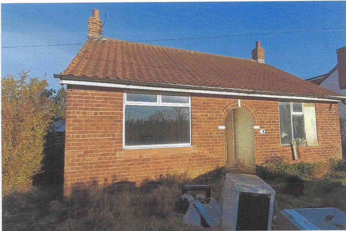
FRONT ELEVATION OF PROPERTY - LOOKING NORTH