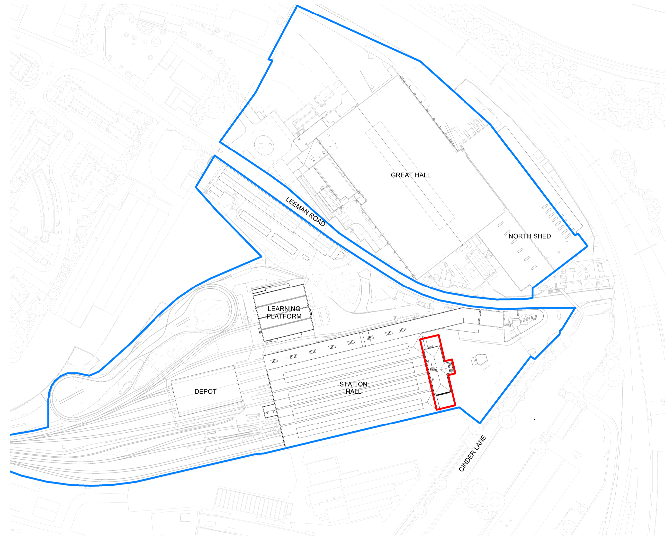
1 Site Plan - Existing 1 : 1250

General Notes: 1. All dimensions are in millimetres unless noted otherwise. 2. All dimensions shall be verified on site before proceeding with the work. 3. Fielden Fowles shall be notified in writing of any discrepancies. 4. There are a number of Contractor Design Portions (CDPs) within the design drawings and specification. Refer to list of items within specification. 5. Existing internal partitions are indicative only. They were not included in the measured survey. 6. All Mechanical and Electrical services shown on this drawing is purely indicative. Please refer to M&E Engineers drawings.