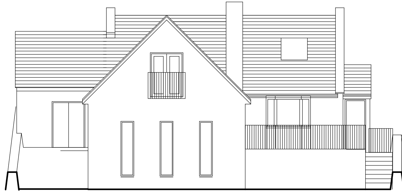
Existing Rear Elevation. 1.100