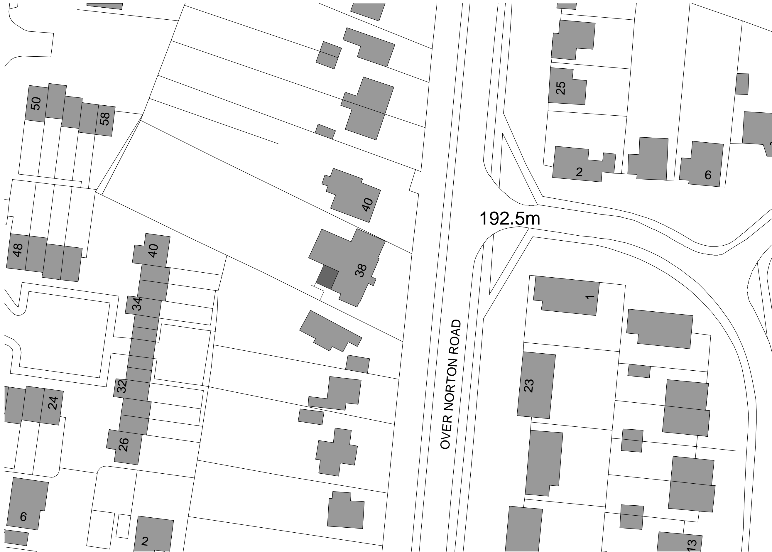
Block Plan. 1.500