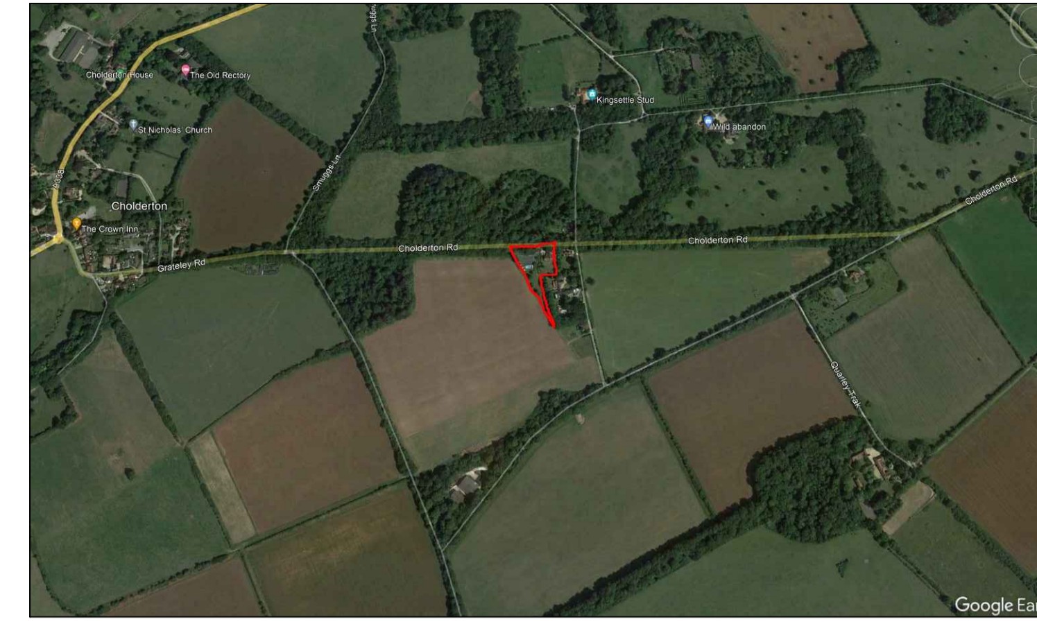
The red lines on the above picture DO NOT represent the boundaries of the site. It only indicates the approx location of the property in relation to the village of Cholderton and the surrounding area.

This is a scaled drawing for planning purposes. Contractor to check all dimensions on site prior to the commencement of the works.