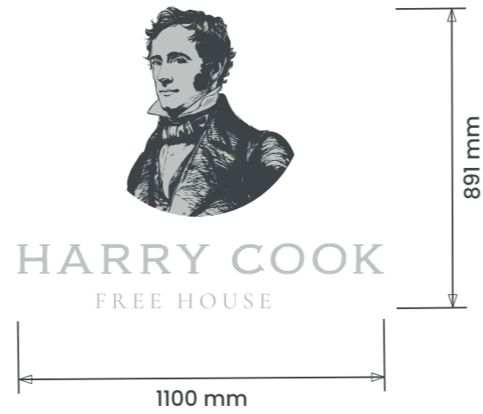
ITEM 06B (Qty 1) WINDOW GRAPHICS Window vinyl graphics Scale 1:20