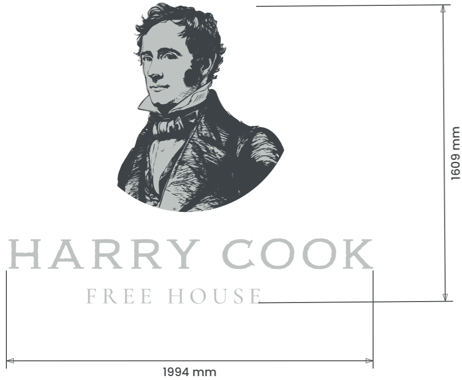
ITEM 06C (Qty 1) WINDOW GRAPHICS Window vinyl graphics Scale 1:20