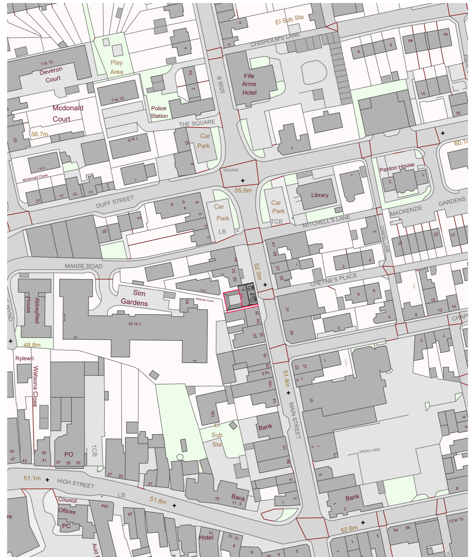
Location Plan Scale 1:1250@A2