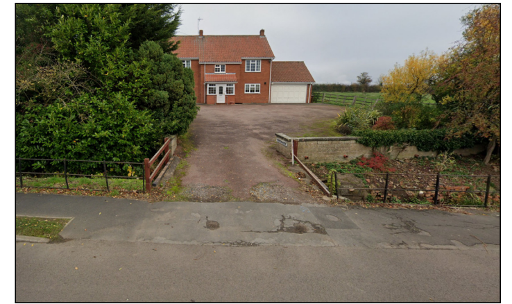
View Towards Existing Entrance