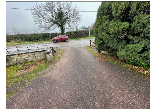
View From House