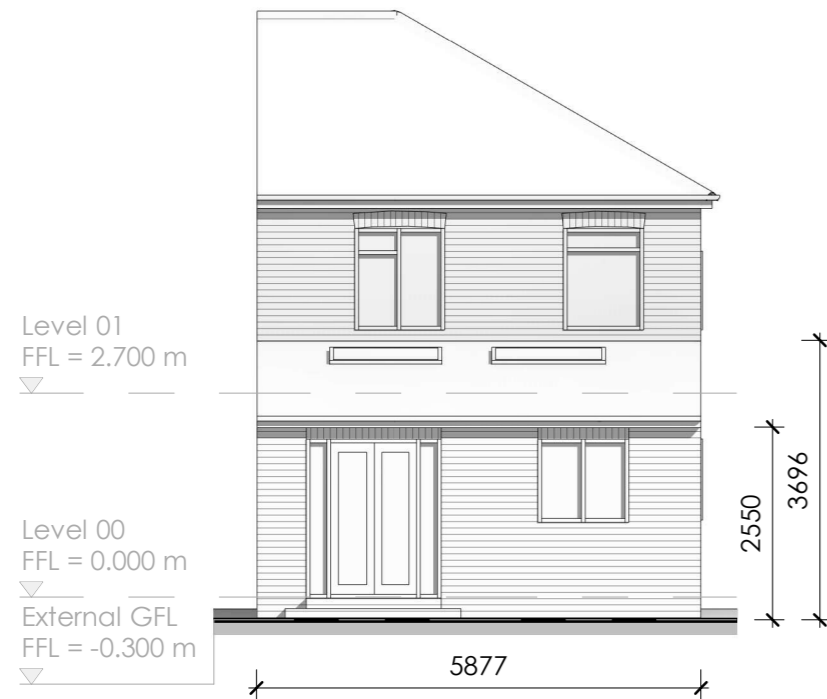
2 Proposed Rear (W) Elevation 1 : 100