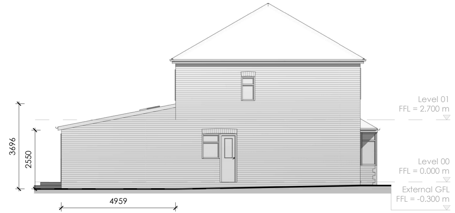
4 Proposed Side (S) Elevation 1 : 100