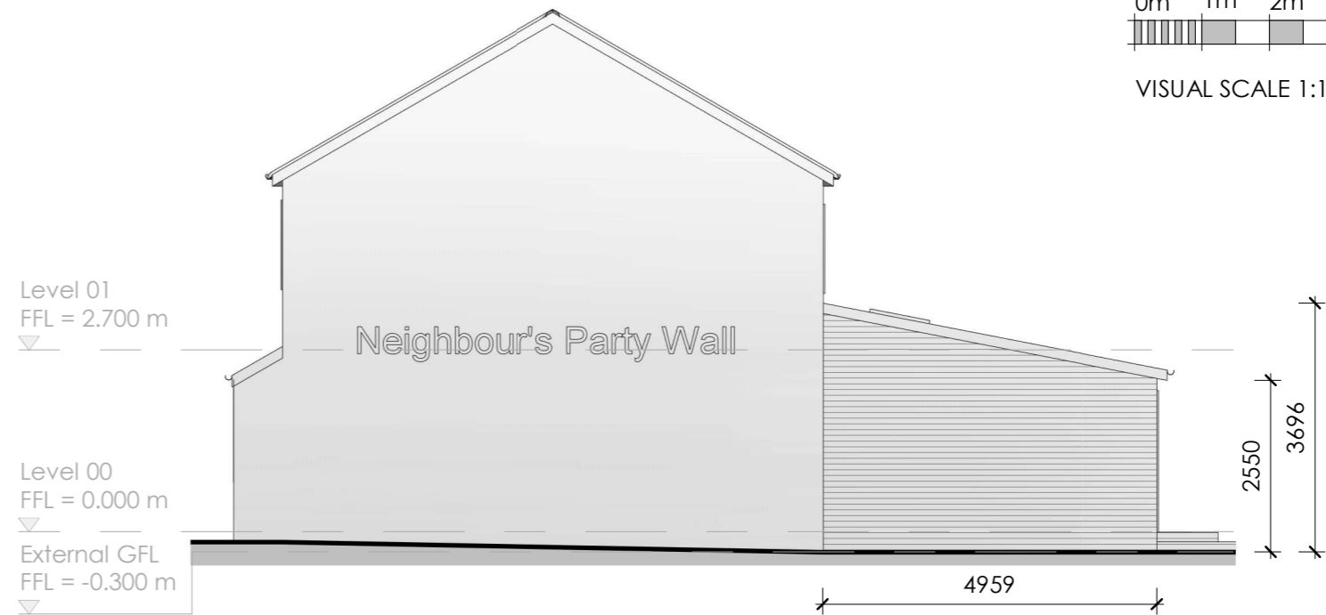
3 Proposed Side (N) Elevation 1 : 100