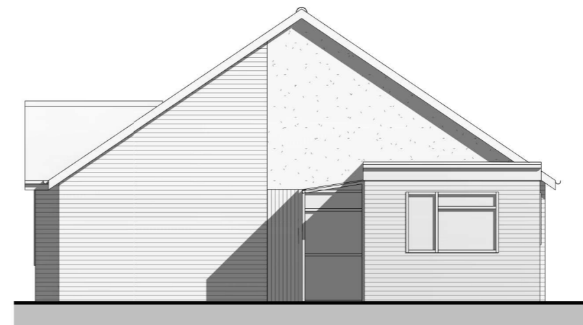
3 Existing Side (N-E) Elevation 1 : 100