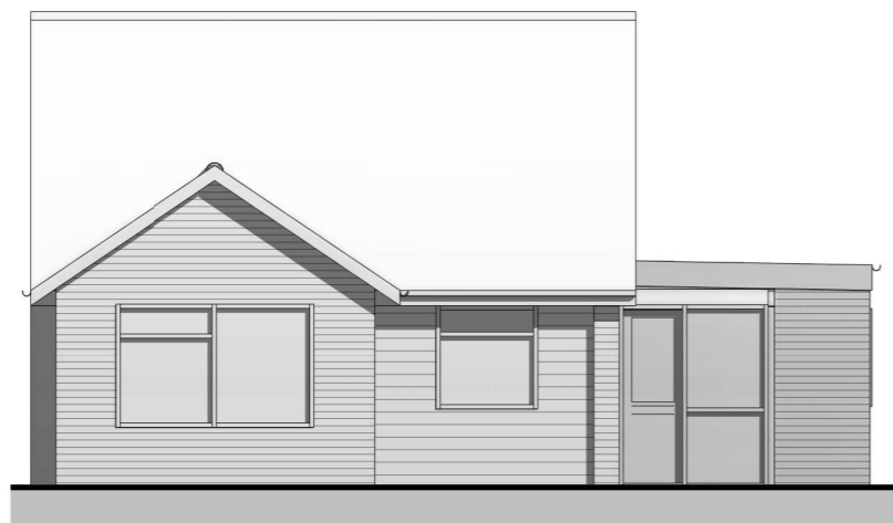
1 Existing Front (S-E) Elevation 1 : 100

THESE DRAWINGS ARE UNDER THE OWNERSHIP OF DESIGN DESIGNED LTD. IF ANY CHANGES ARE MADE TO THE DESIGN WITHOUT PRIOR DISCUSSION WITH DESIGN DESIGNED, THE PERSON(S) RESPONSIBLE WILL TAKE ON THE PRINCIPAL DESIGNER ROLE, ITS RESPONSIBILITIES AND LIABILITIES.