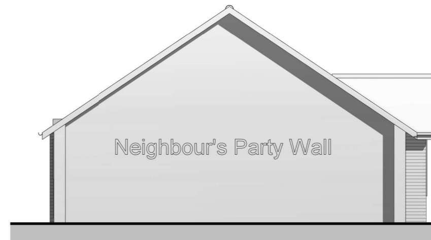
4 Existing Side (S-W) Elevation 1 : 100