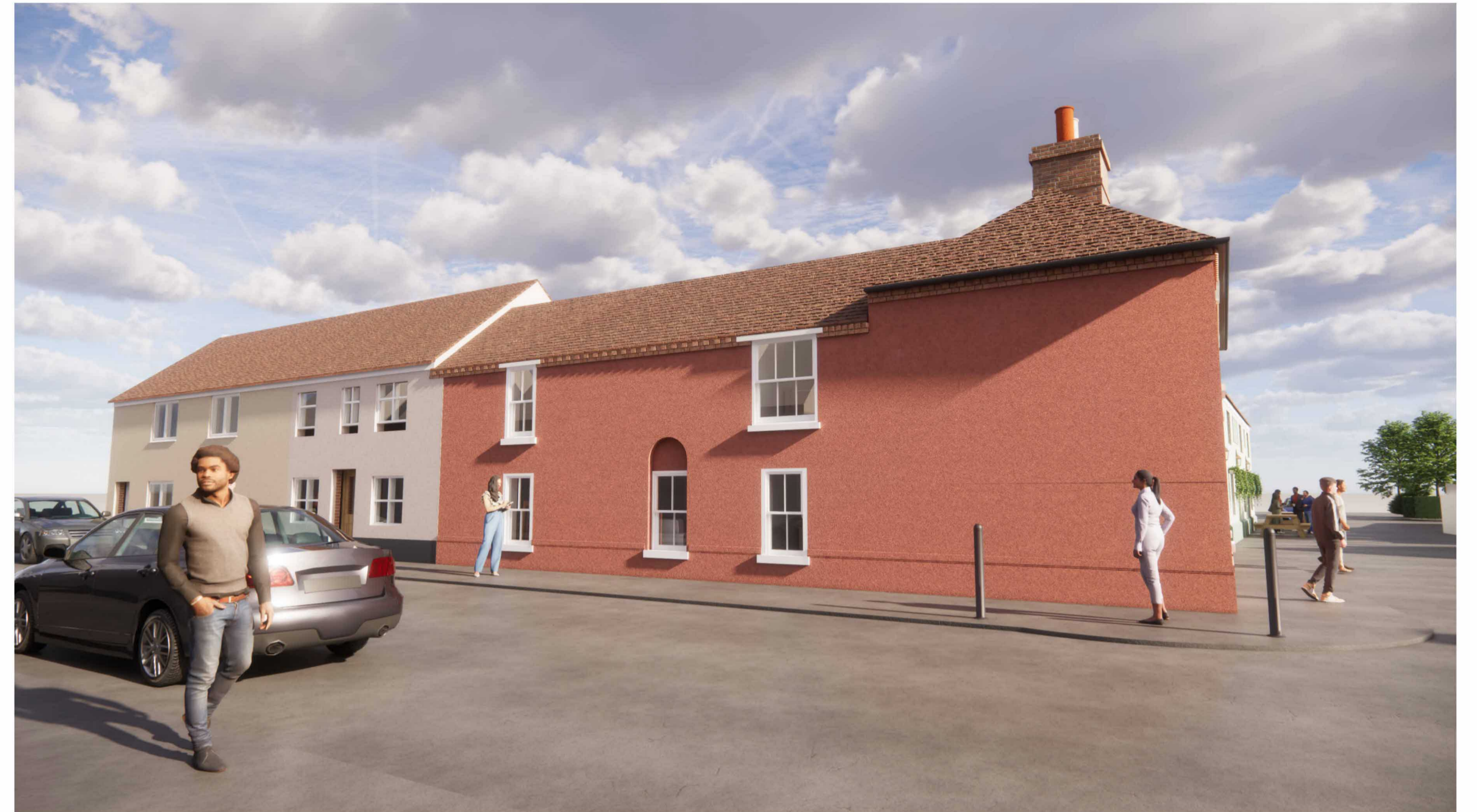
3D View 01