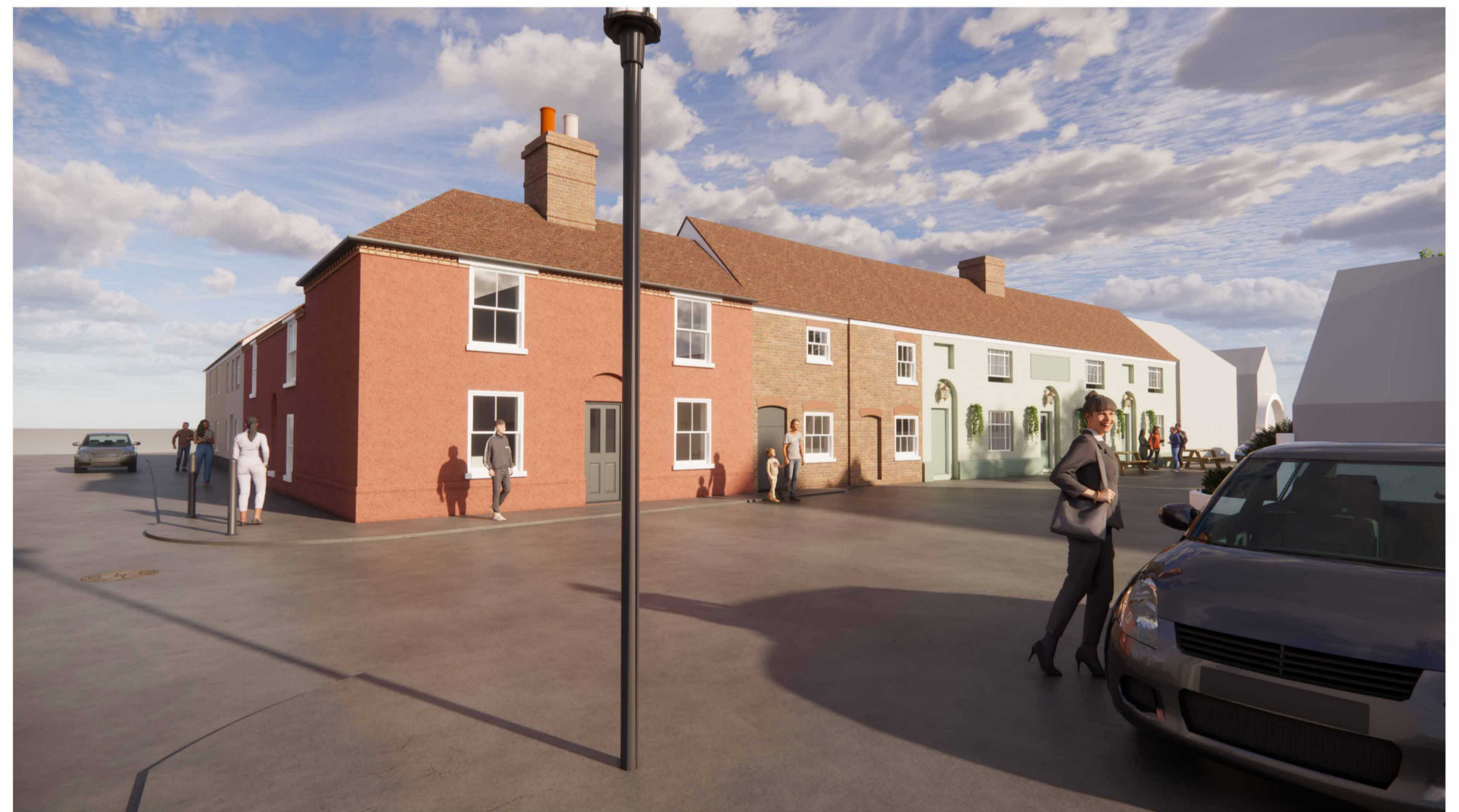
3D View 02