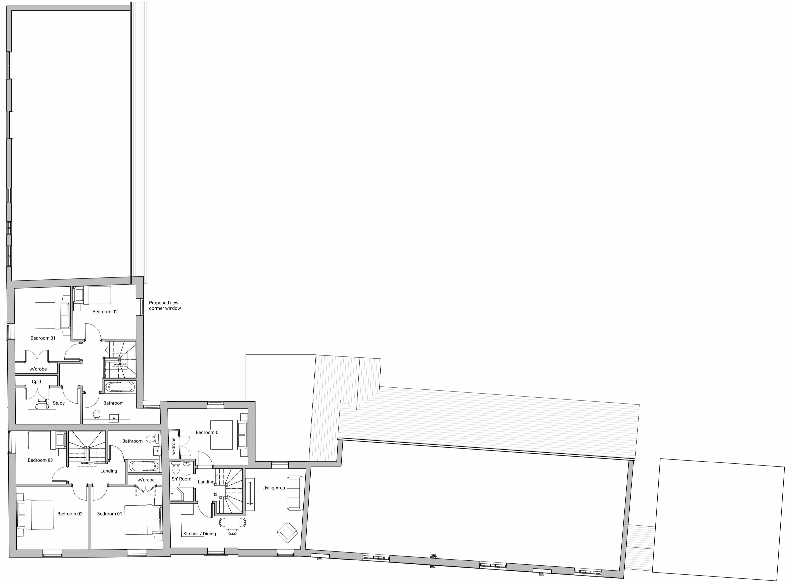
First Floor Plan Proposed 1 : 100