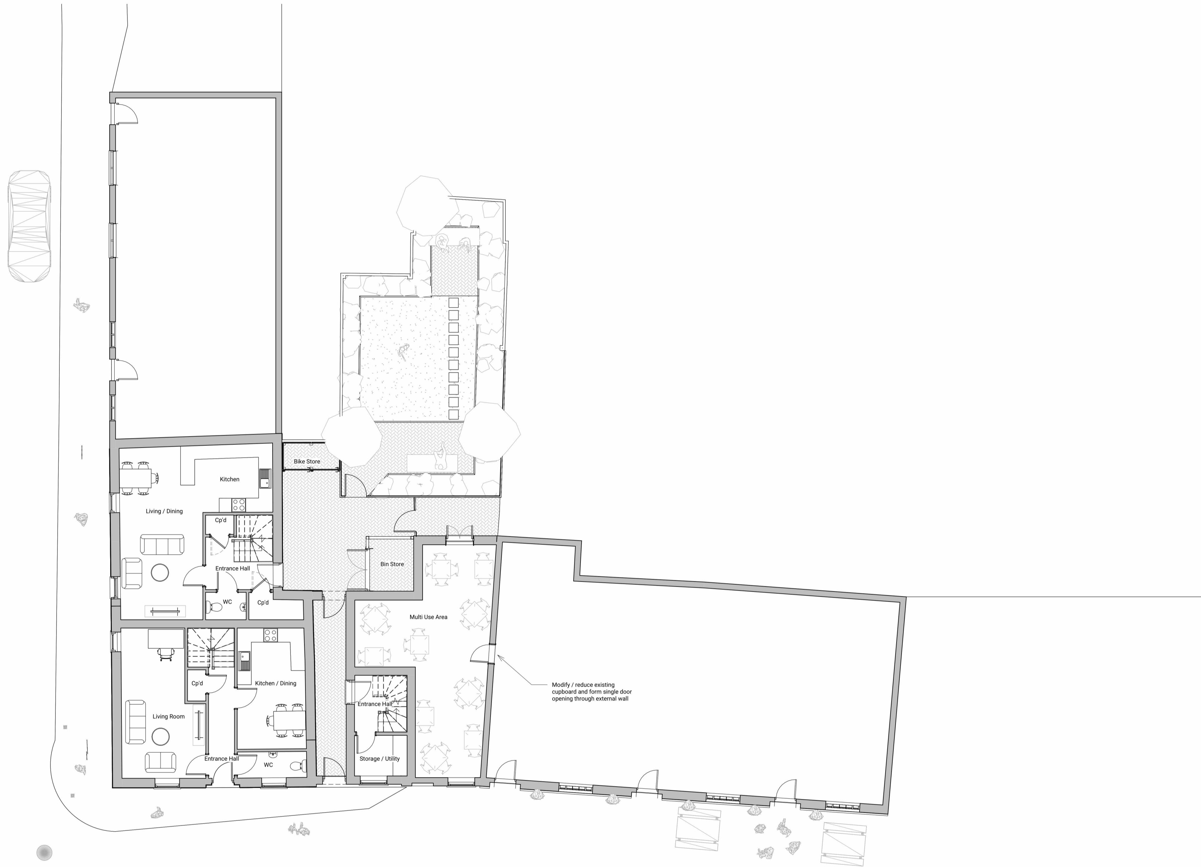
Ground Floor Plan 1 : 100