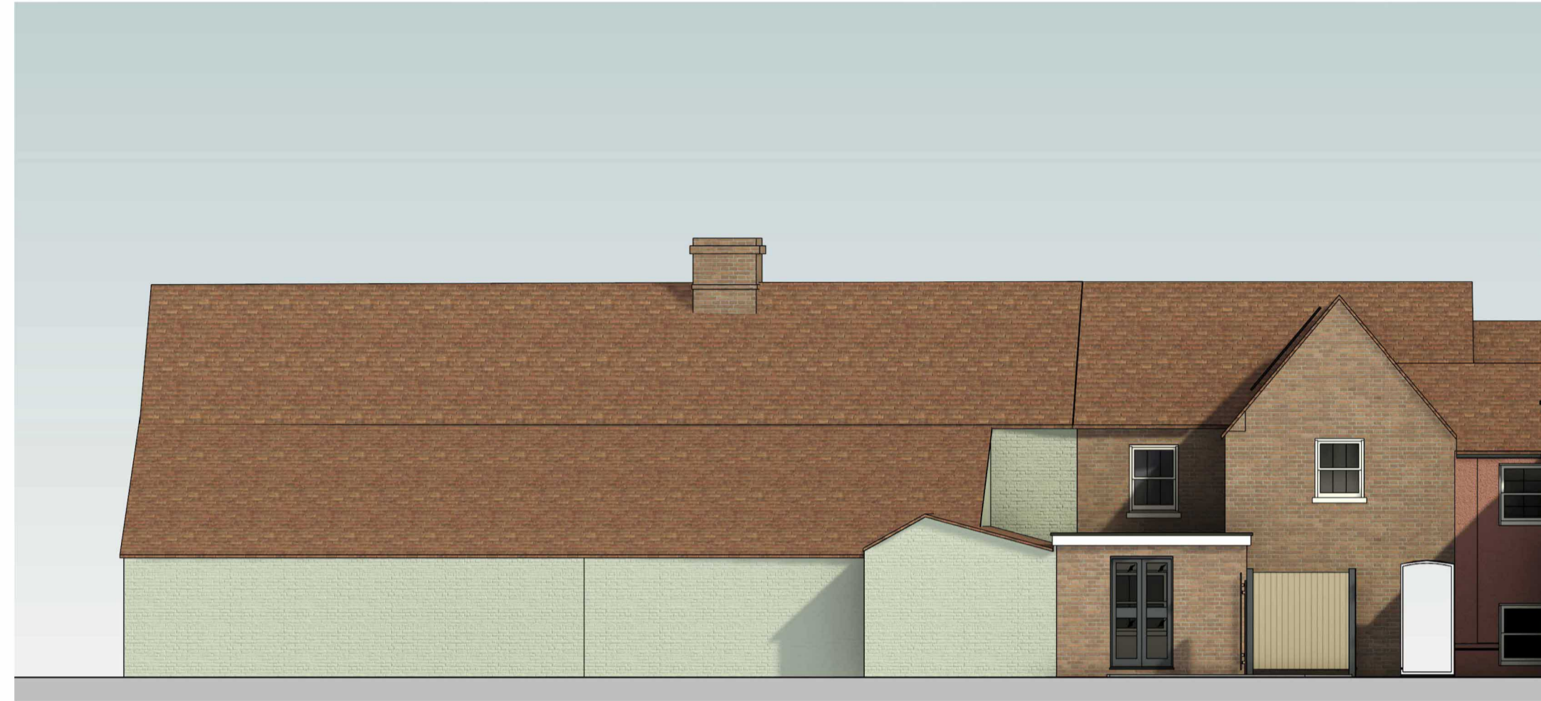
Rear Elevation 1 : 100