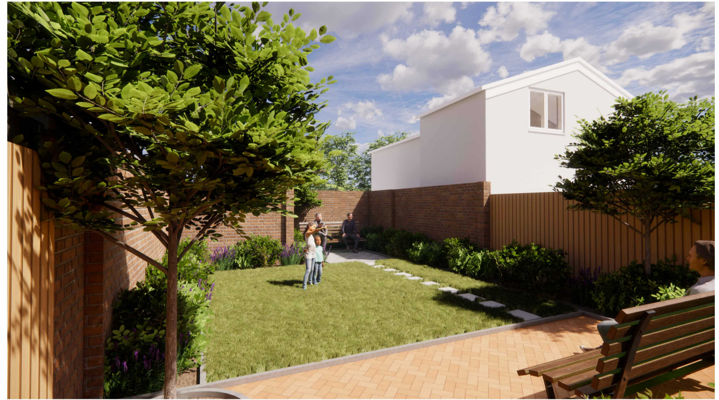
3D Garden View 01