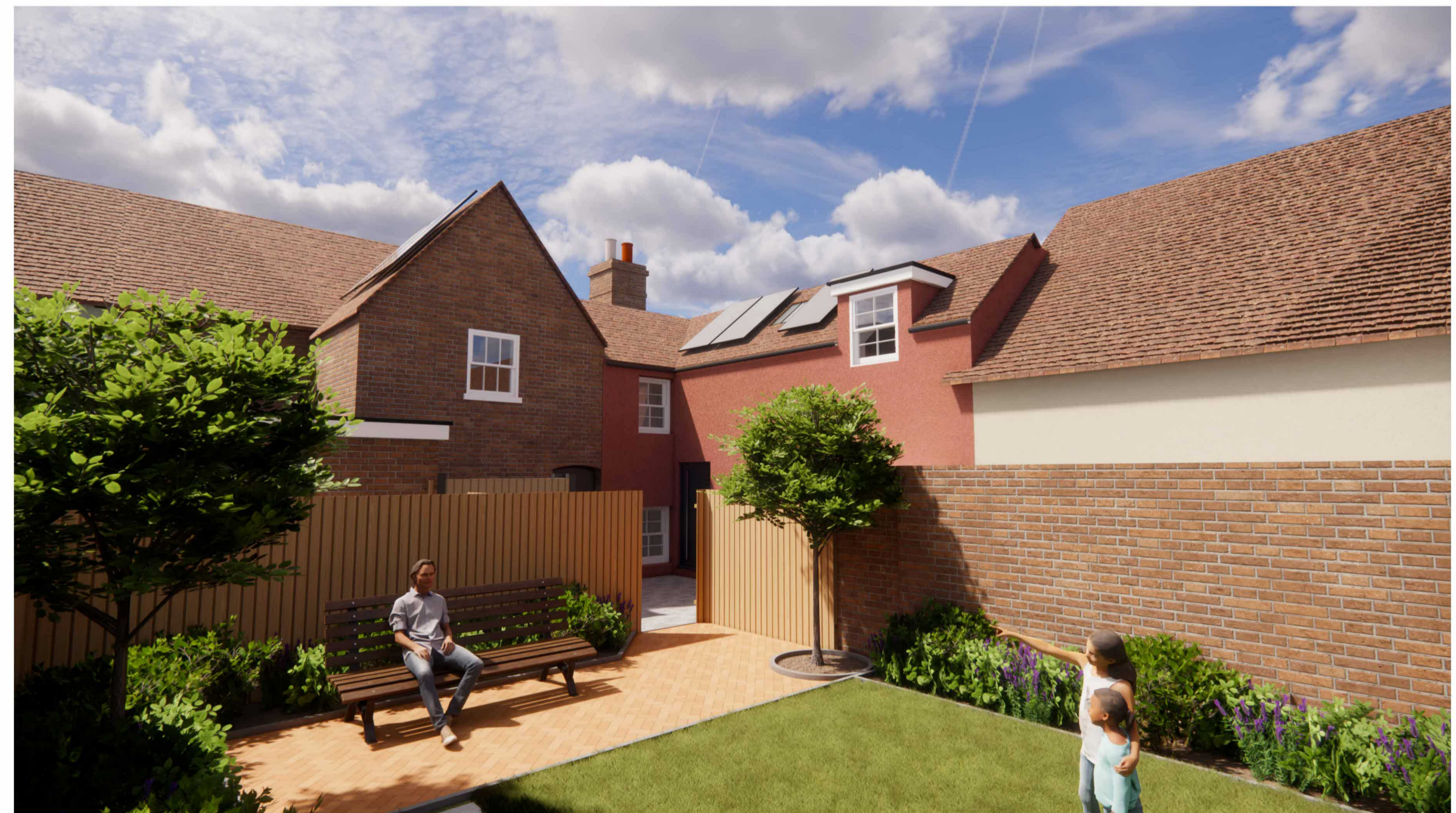
3D Garden View 02