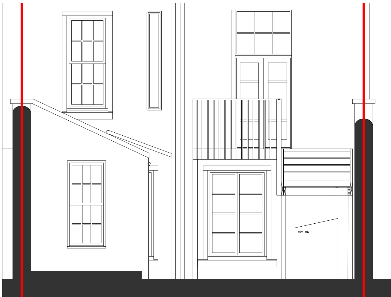
3 | Cross Section