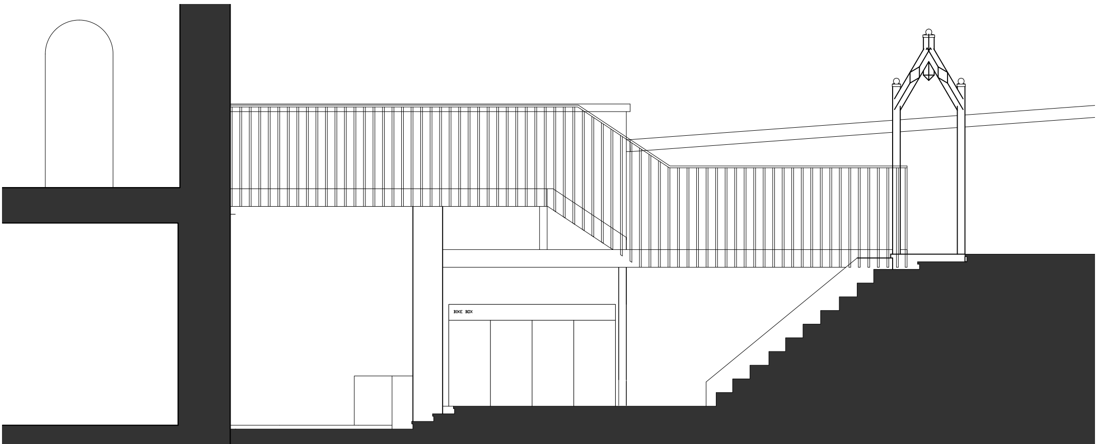
1 | Long Section 1