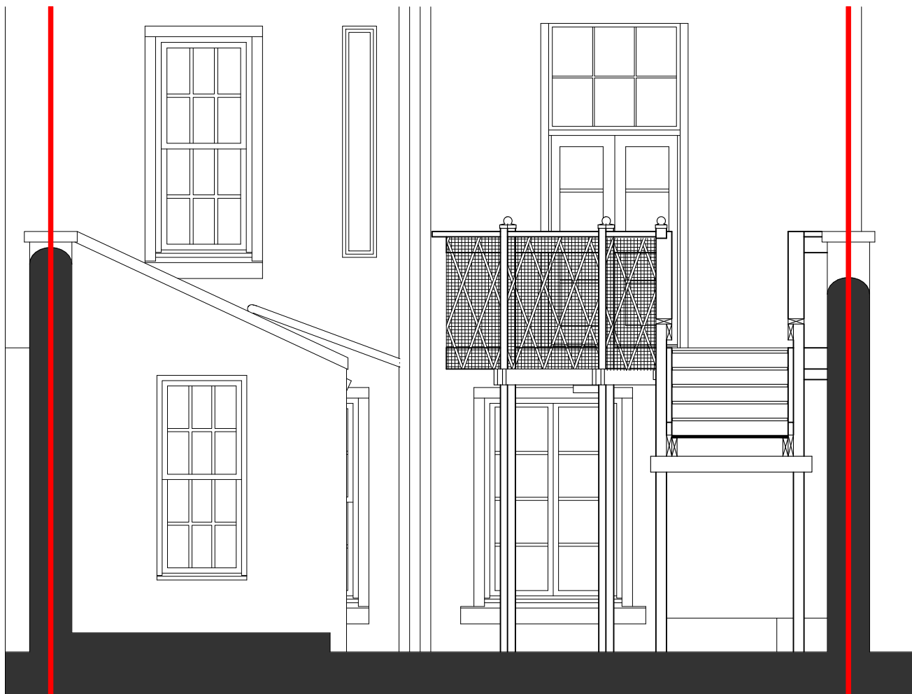
3 | Cross Section