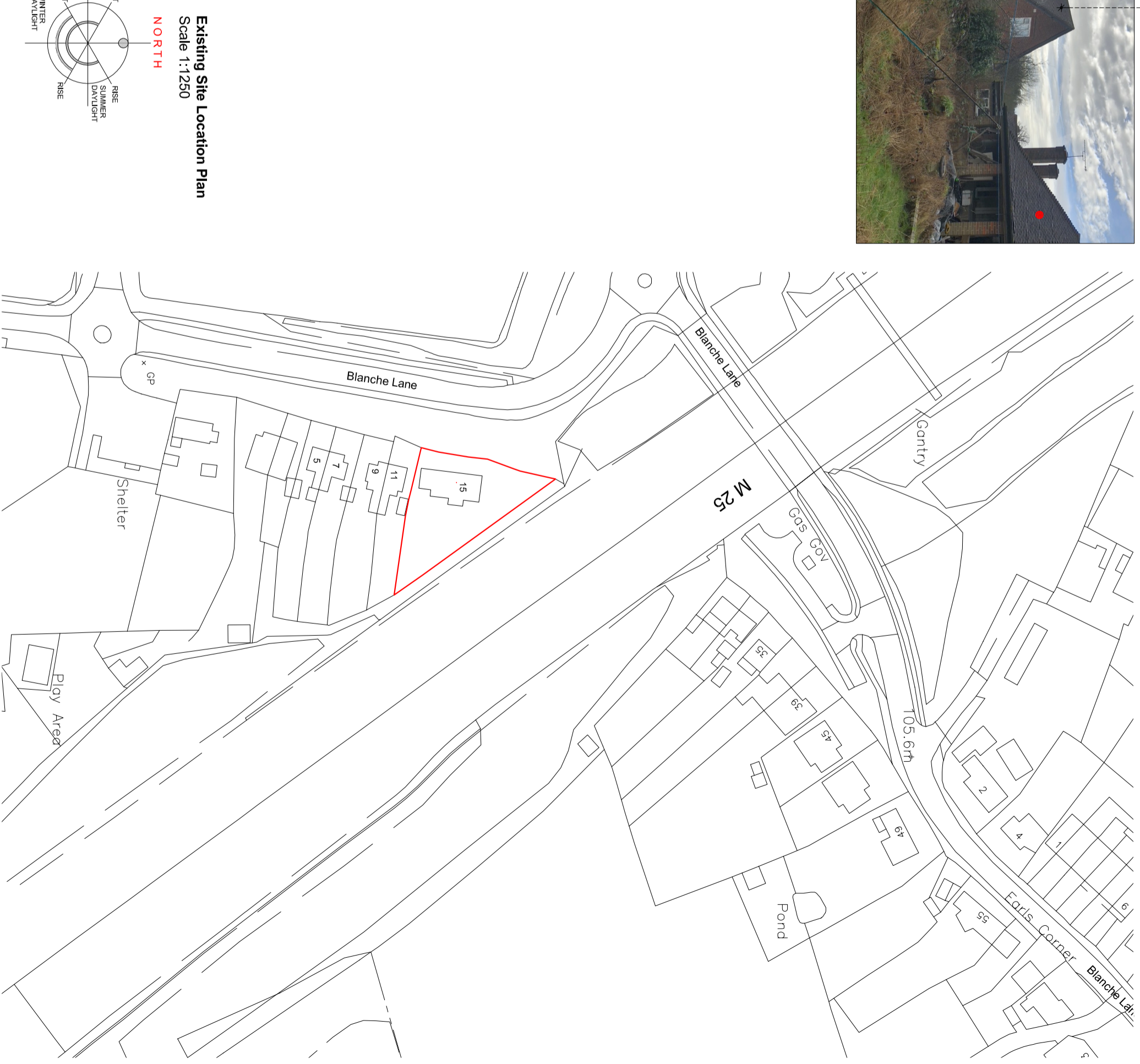
No. 11 Blanche Lane

Notes Report any discrepancies to the Planning Department For planning purposes only 0m 1 2 3 4 5 1:100 0m 12.5 25 37.5 50 62.5 1:1250