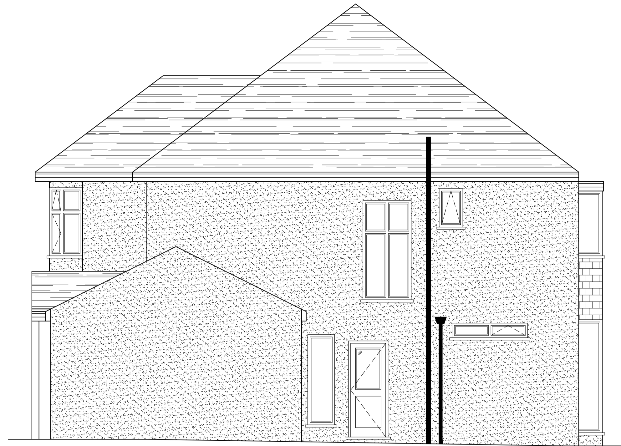
EXISTING SIDE ELEVATION A SCALE 1:50