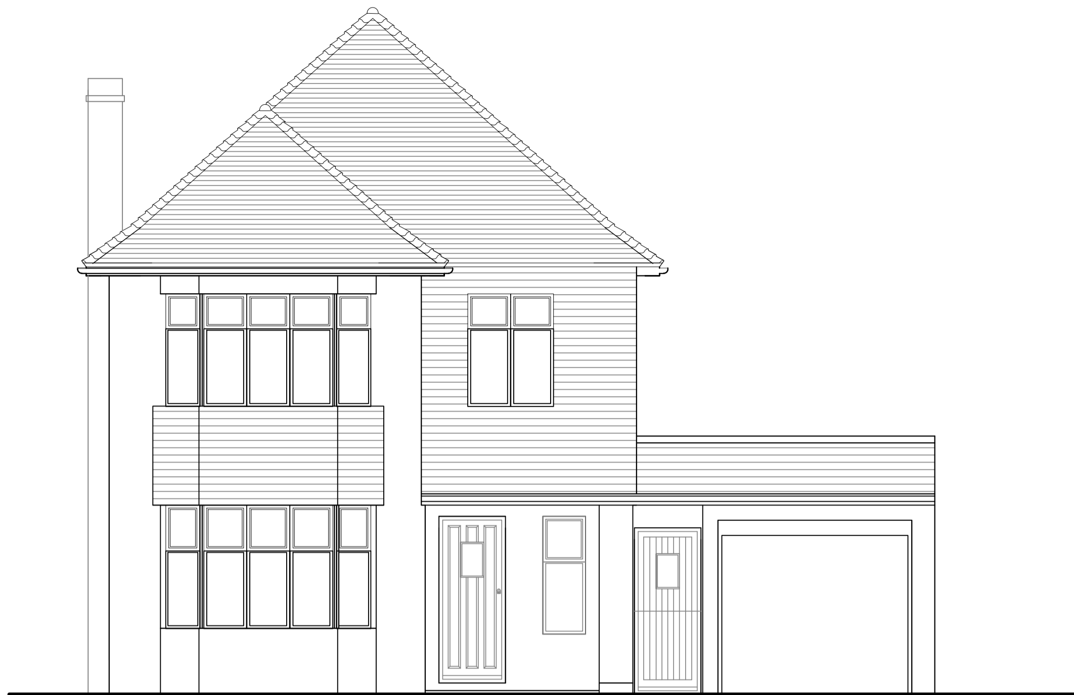
EXISTING FRONT ELEVATION Scale 1:50