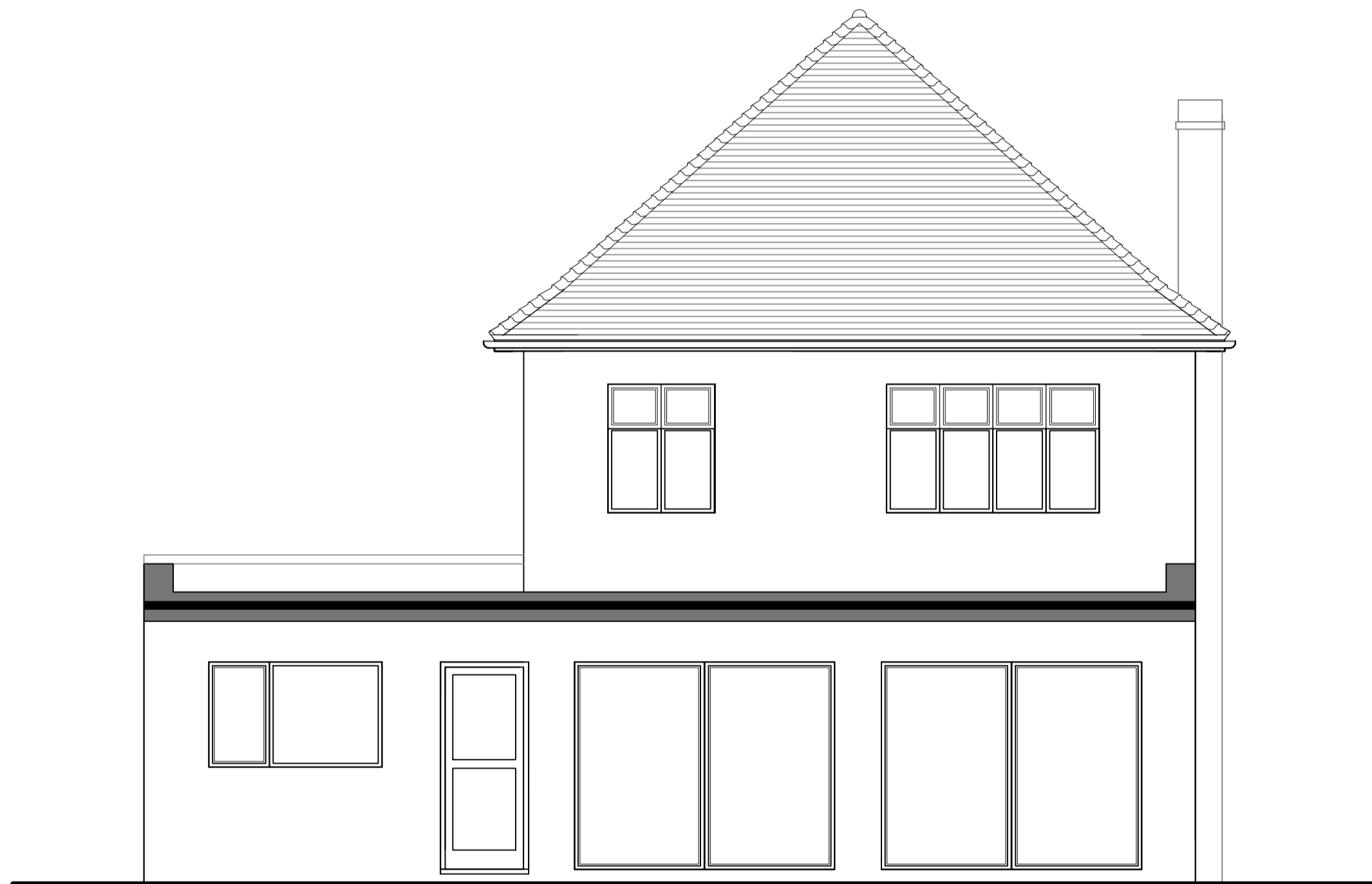
EXISTING REAR ELEVATION Scale 1:50