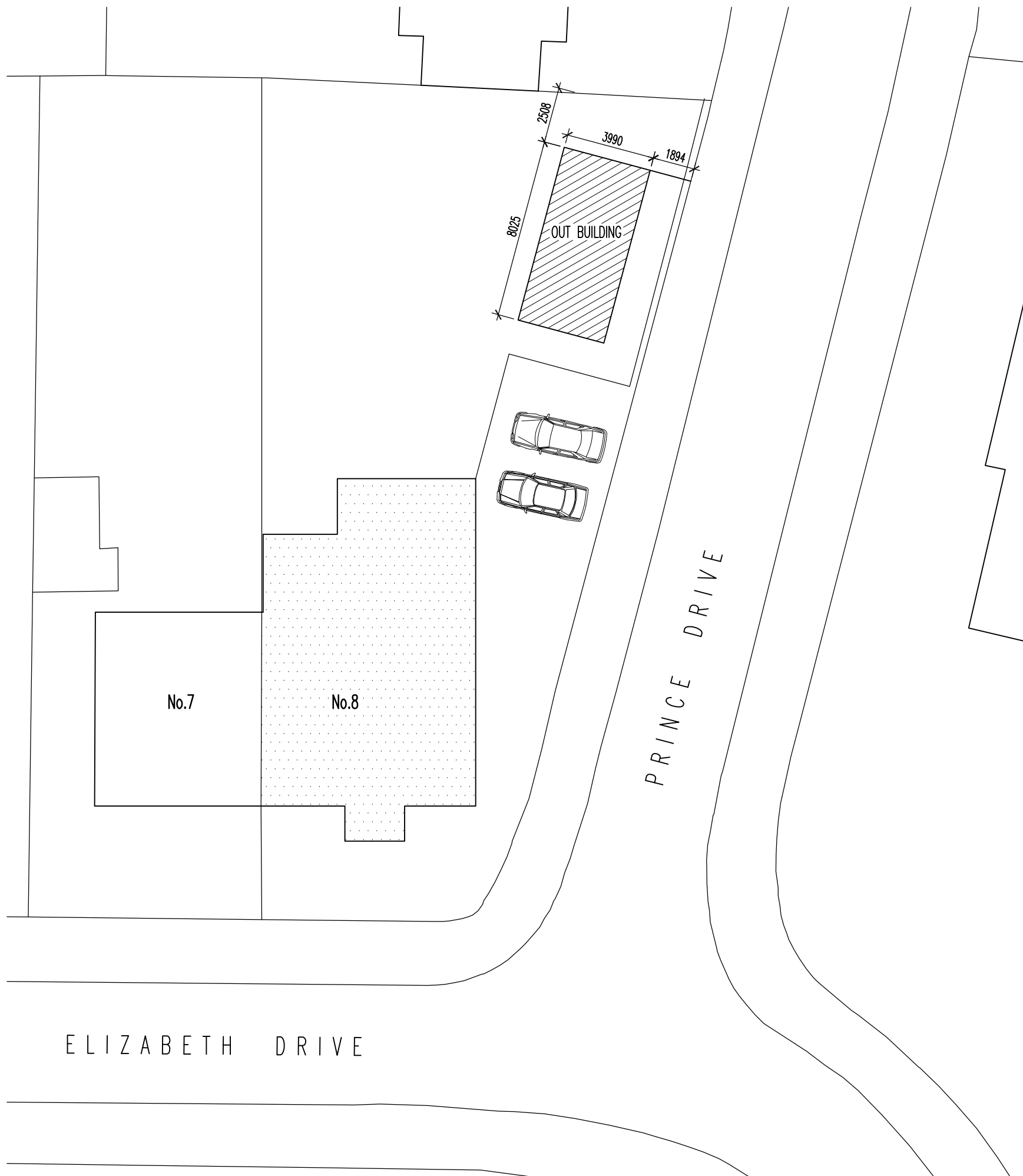
BLOCK PLAN 1:200

THIS DRAWING IS ISSUED FOR THE SOLE AND EXCLUSIVE USE OF THE NAMED RECIPIENT. DISTRIBUTION TO ANY THIRD PARTY IS ON THE STRICT UNDERSTANDING THAT NO LIABILITY IS ACCEPTED BY JAYESH VAJA FOR ANY DISCREPANCIES, ERRORS OR OMISSIONS THAT MAY BE PRESENT AND NO GUARANTEE IS OFFERED AS TO THE ACCURACY OF INFORMATION SHOWN.