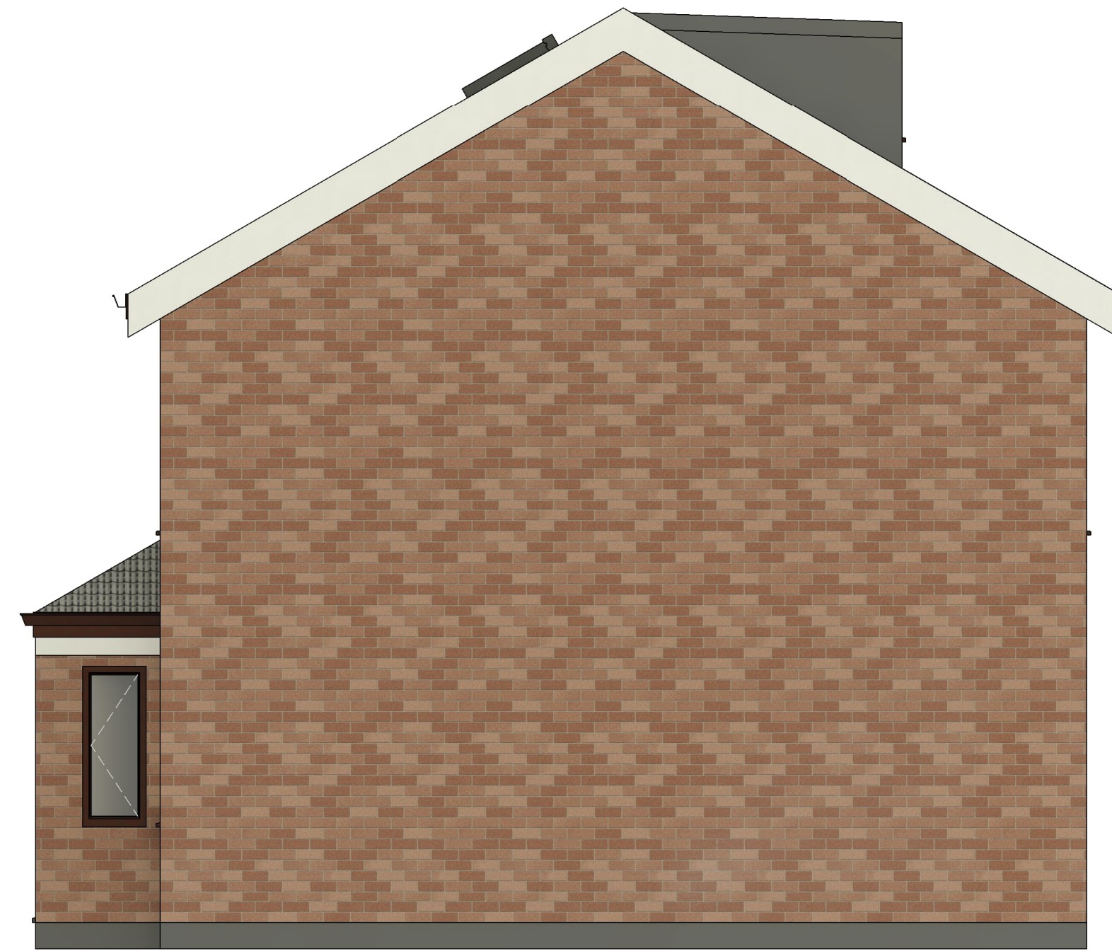
4 Existing Side Elevation B 1: 50