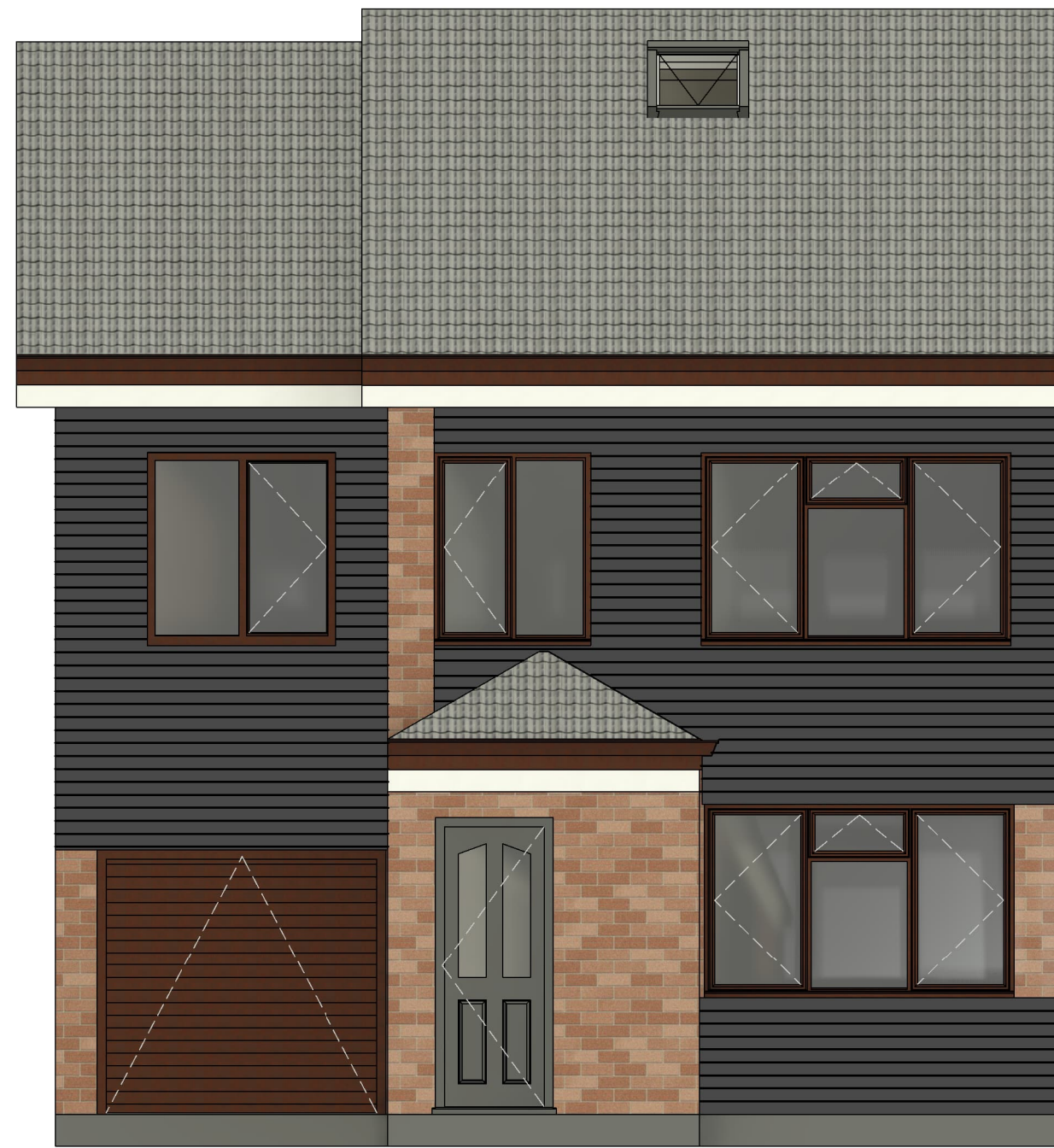
1 Existing Front Elevation 1: 50