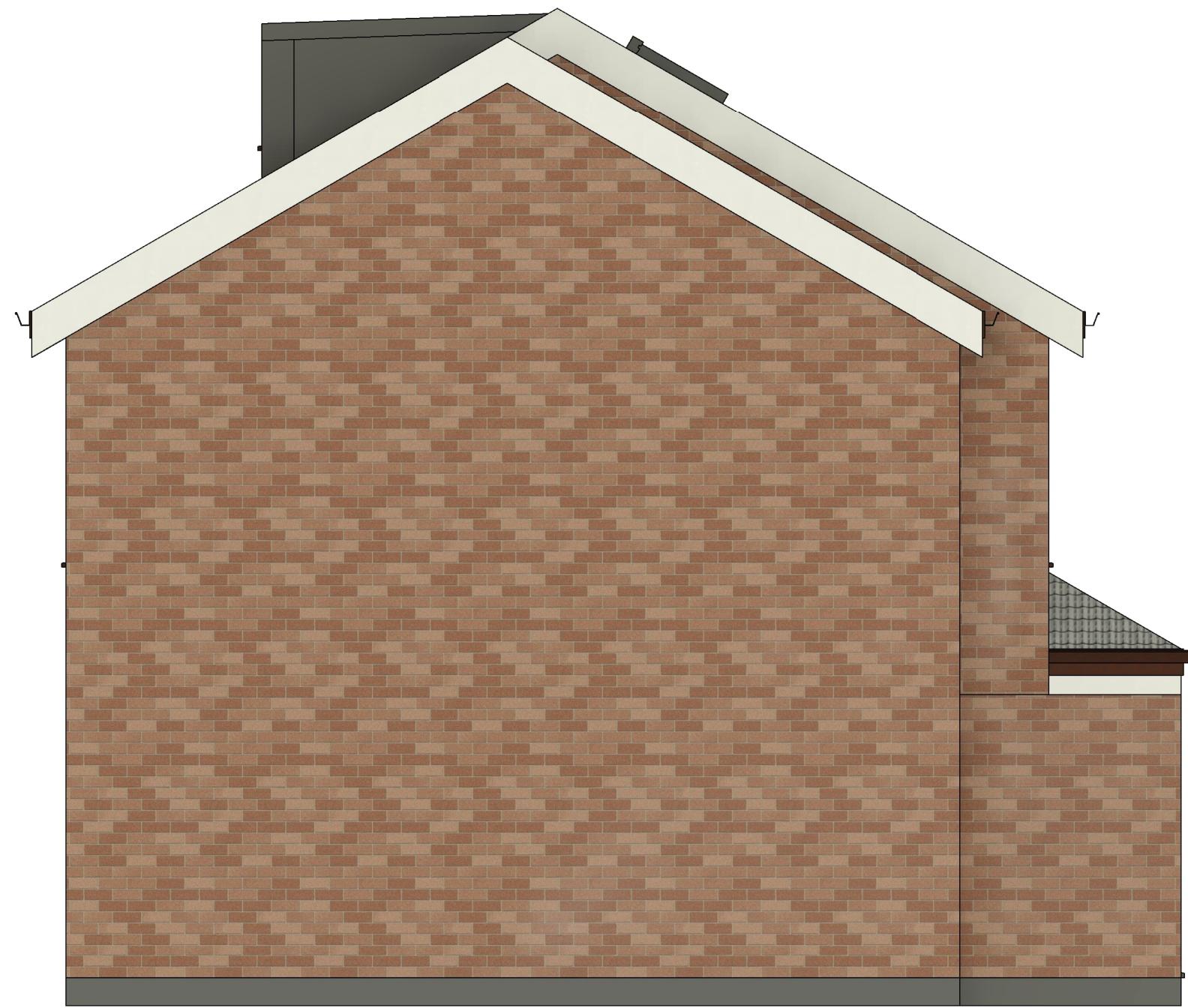
3 Existing Side Elevation A 1: 50