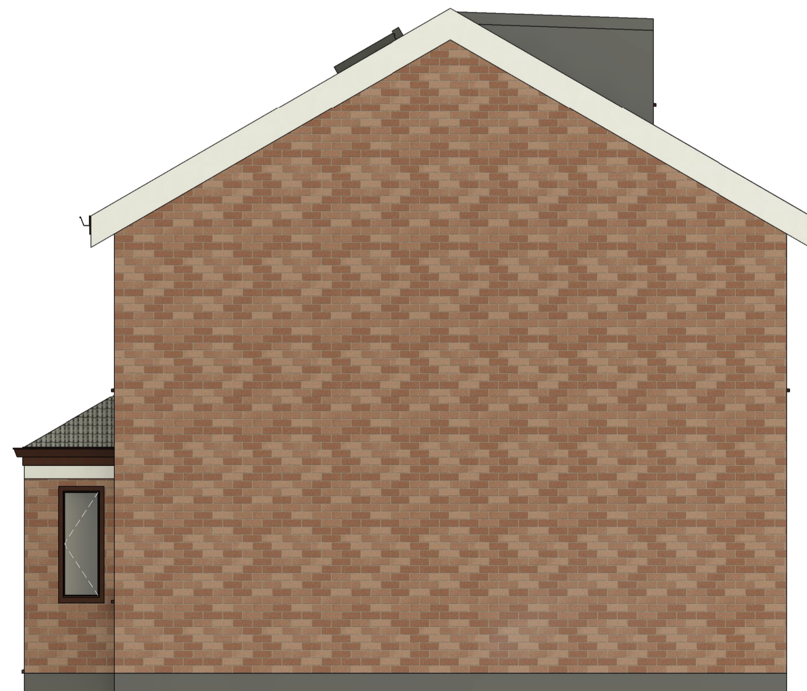
4 Proposed Side Elevation B 1 : 50