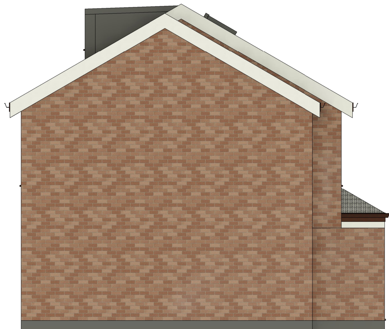
3 Proposed Side Elevation A 1 : 50