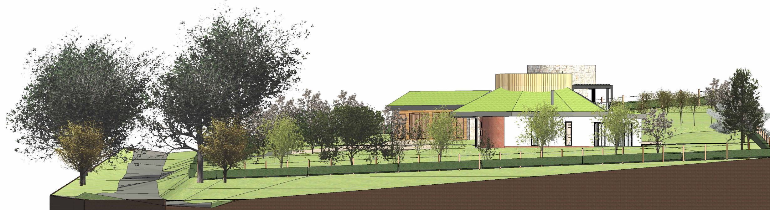
2 3d View 2 - from south