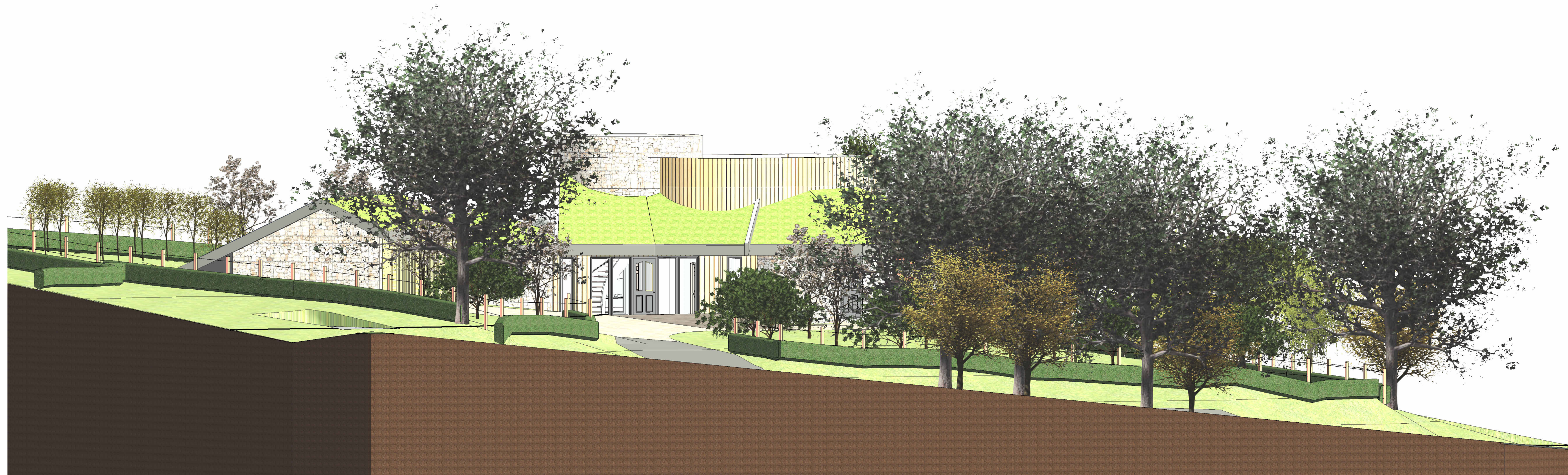
1 3d View 1 - from East