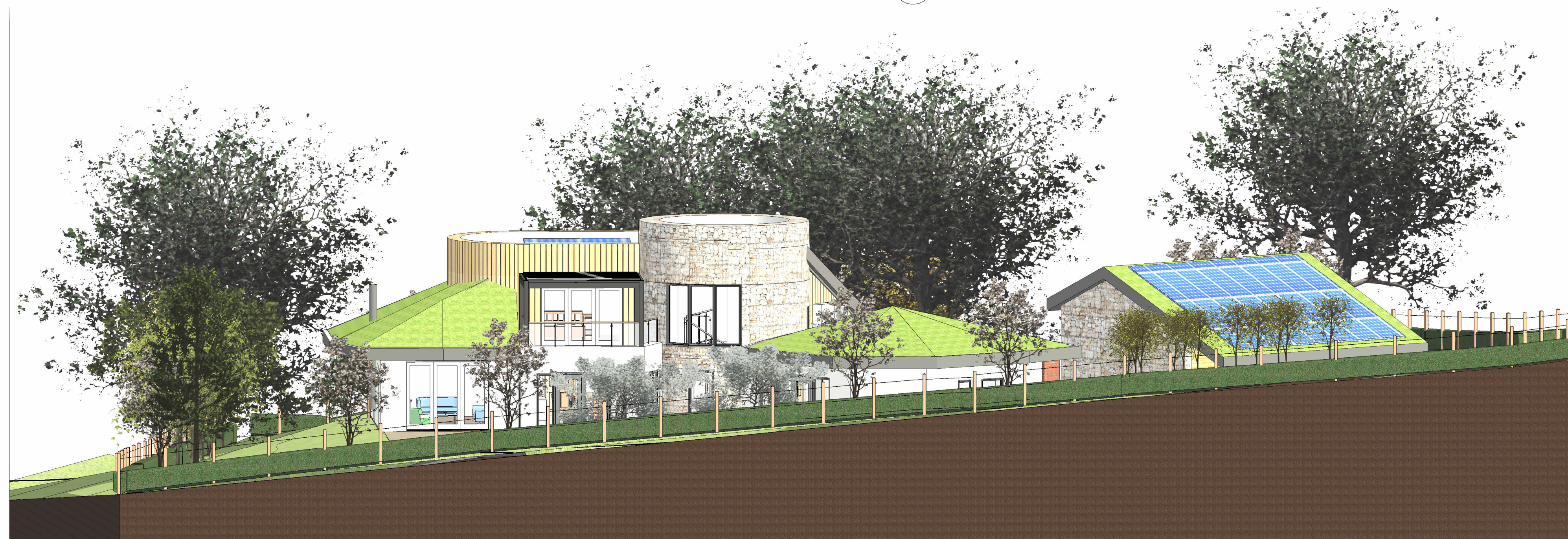
4 3d View 4 - from West