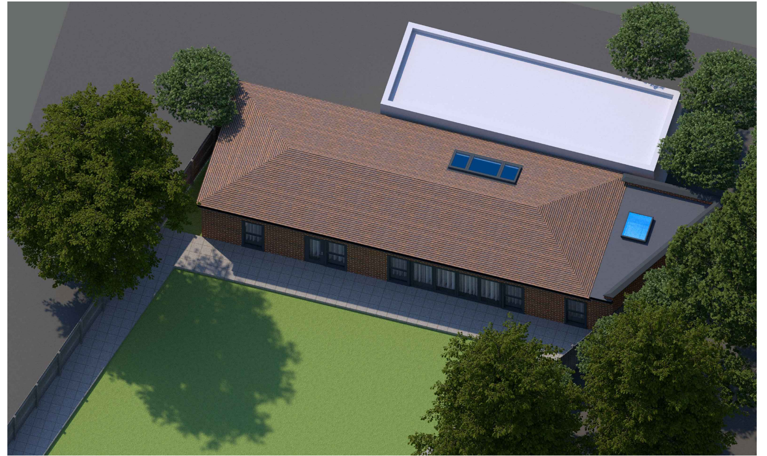
03 - PRO. BIRD EYE VIEW