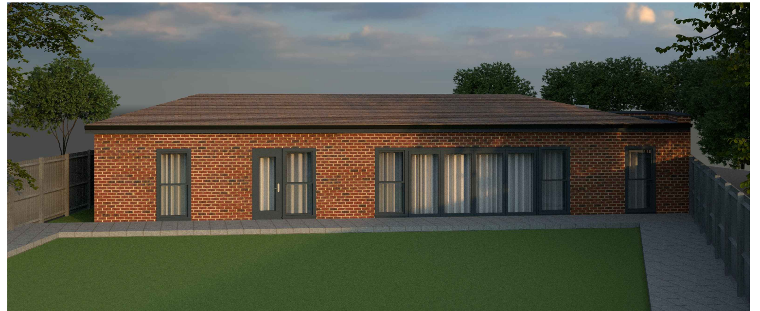
04 - PRO. FRONT VIEW