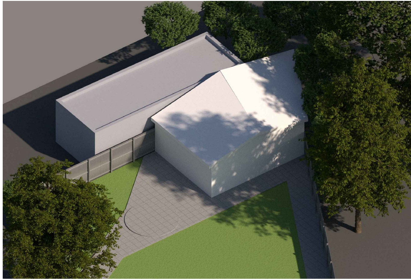
01 - EXISTING VIEW