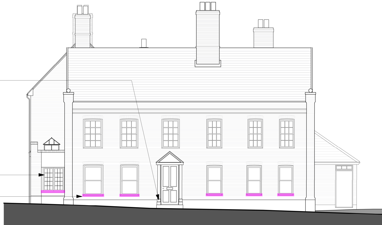
Proposed South Elevation Scale: 1:100