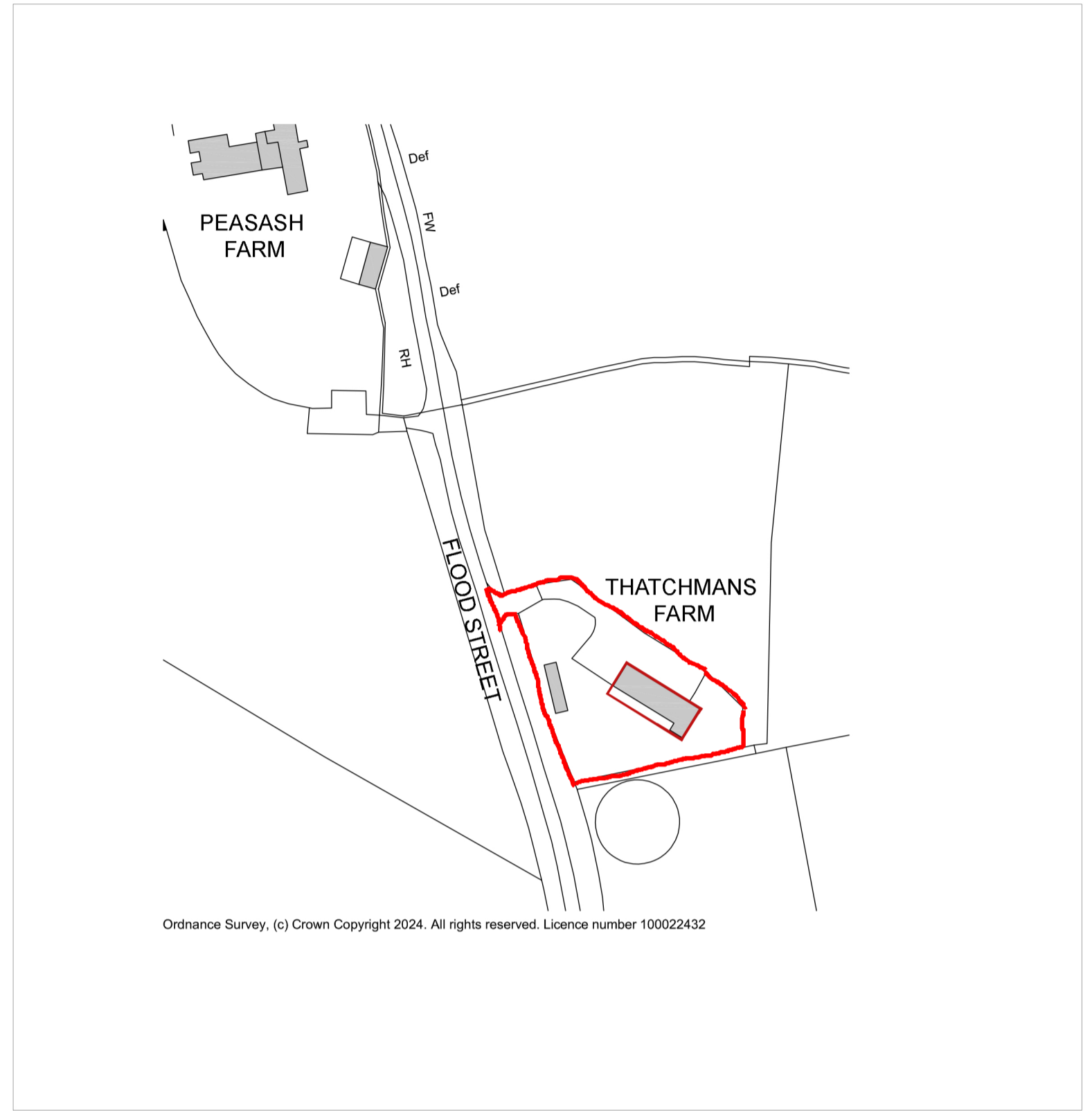
Location Block Plan as Existing (1:1250)