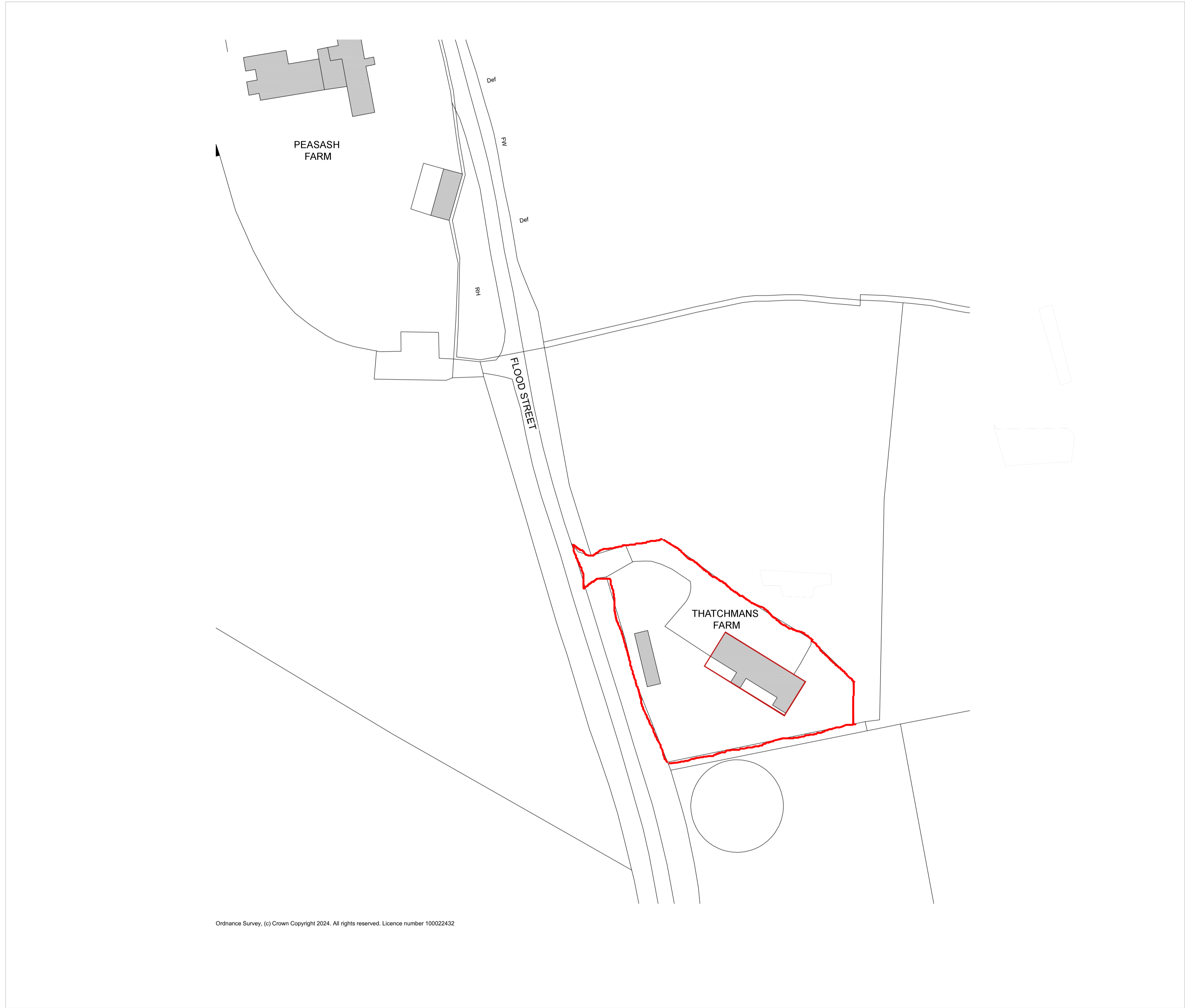
Block Plan as Proposed (1:500)