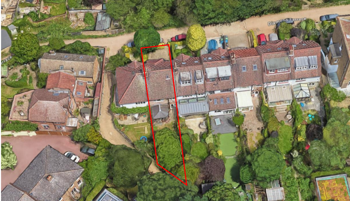
14 Diamond Terrace