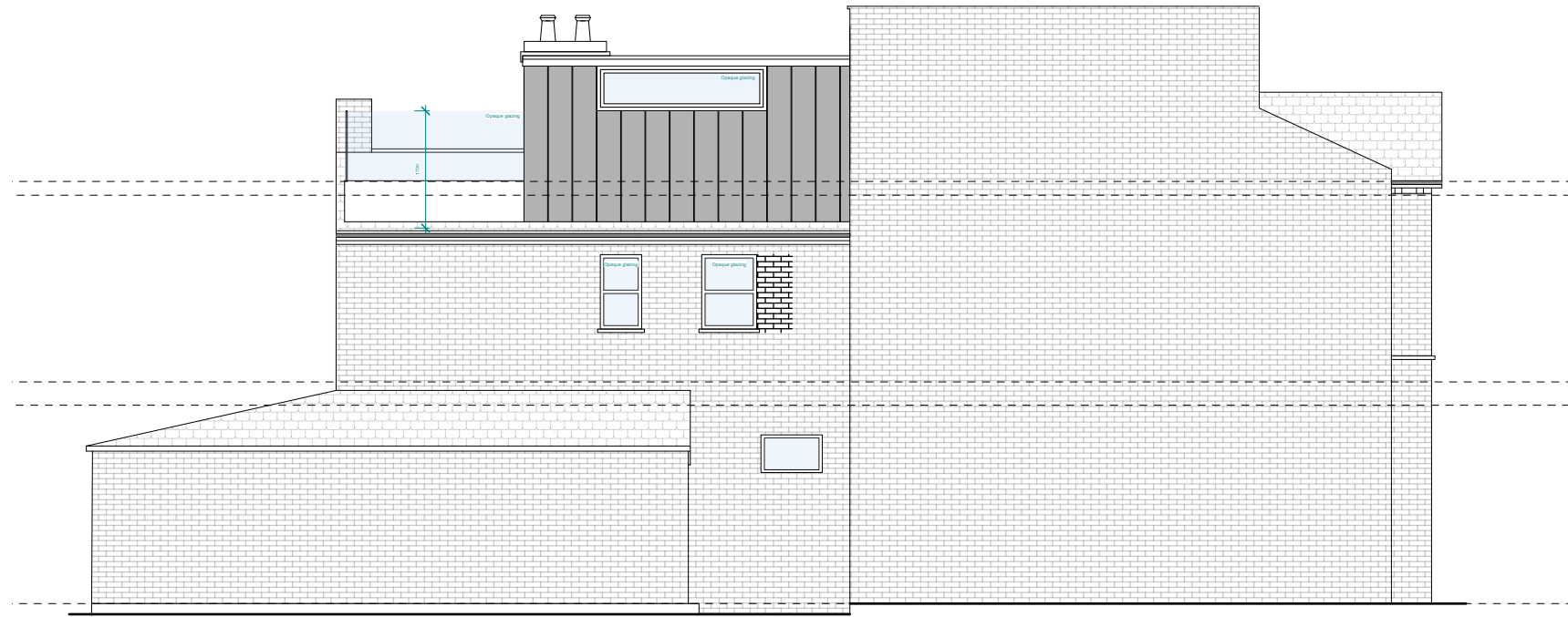
01 SIDE ELEVATION Scale: 1:100