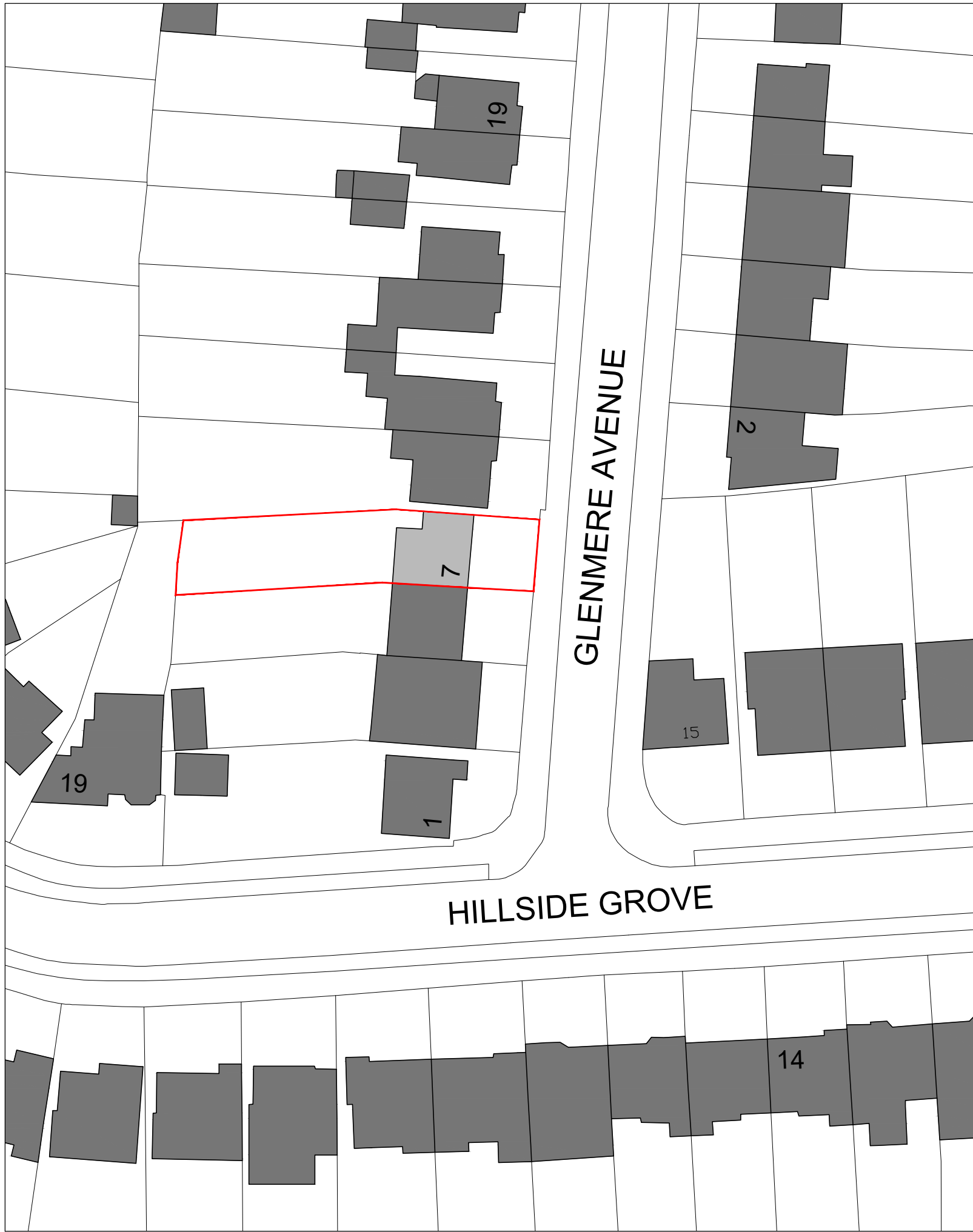
02 Site Block Plan Scale 1:500@A3