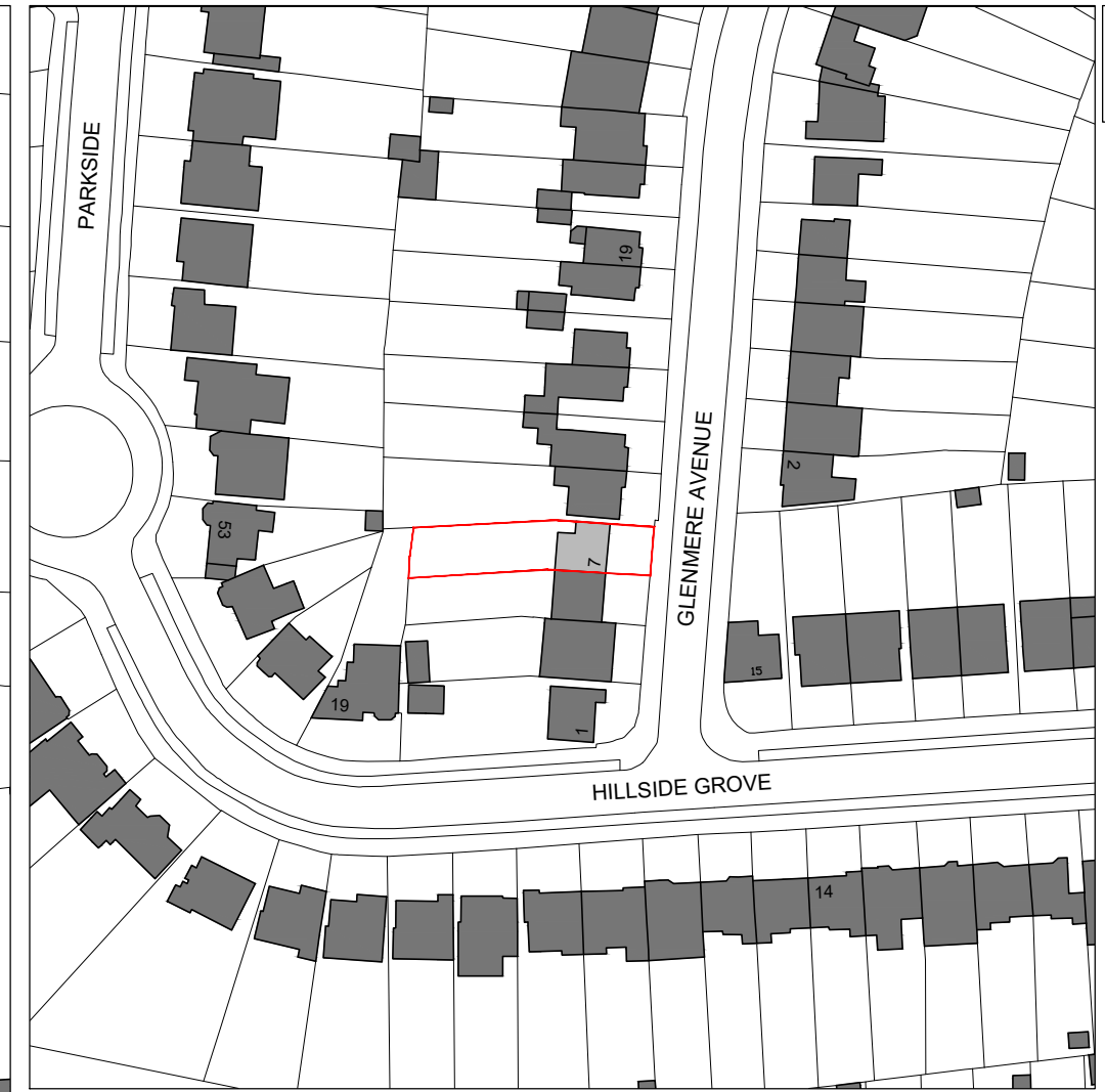
01 Site Location Plan Scale 1:1250@A3