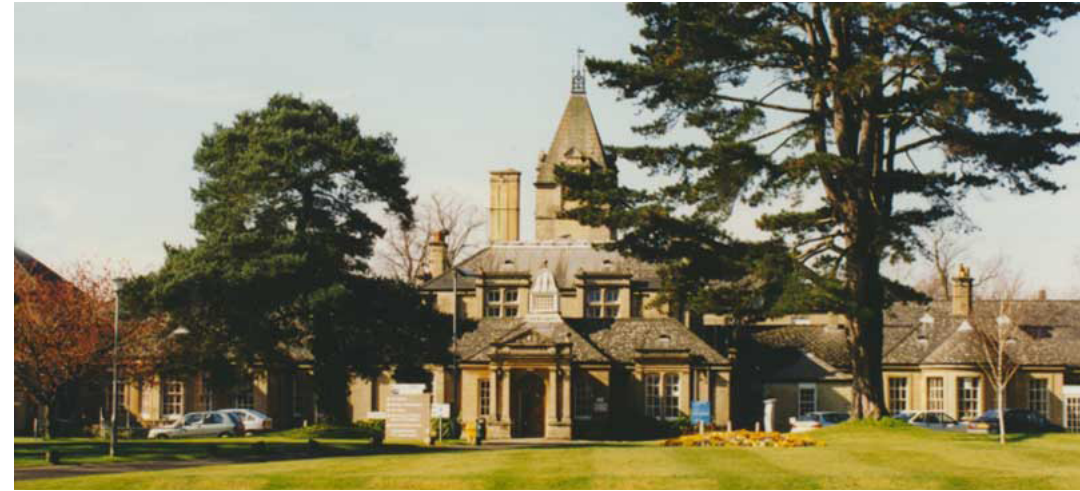
▲ Photo of Main building by William Wilkinson (1877) which currently serves as the hospital's main entrance

Oxford Health NHS Foundation Trust has been asked to produce this document in support of an application to relocate a portakabin and 3 shipping containers to another location at Warneford Hospital in Oxfordshire.