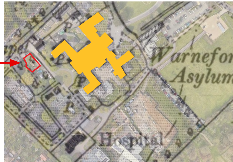
▲ Approx historic building footprint (yellow) in relation to location of the proposals (red)