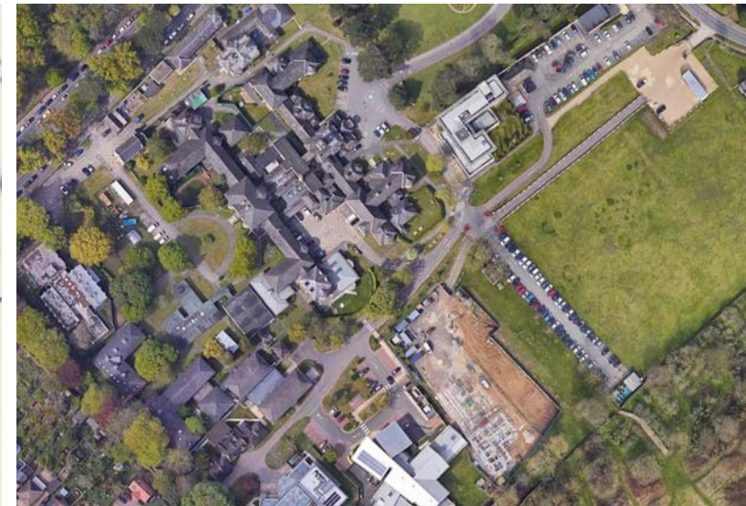
▲ Aerial of the site - 2023

The existing site lies here (red boundary)