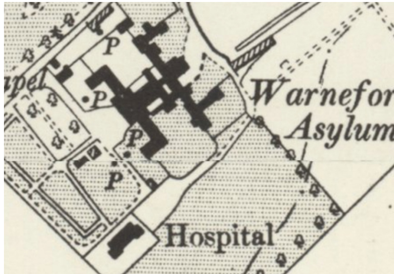
▲ Map of the site - 1899

The building first became listed on the 15th May 1997. In accord with the Listed Building Entry (appendix A) the listed buildings fabric is recognised as being made up of the original building dating back to 1826 along with the later additions up to 1887. Whilst there have been alterations post 1887 up to the date of the building becoming listed in 1997 these are considered insignificant.