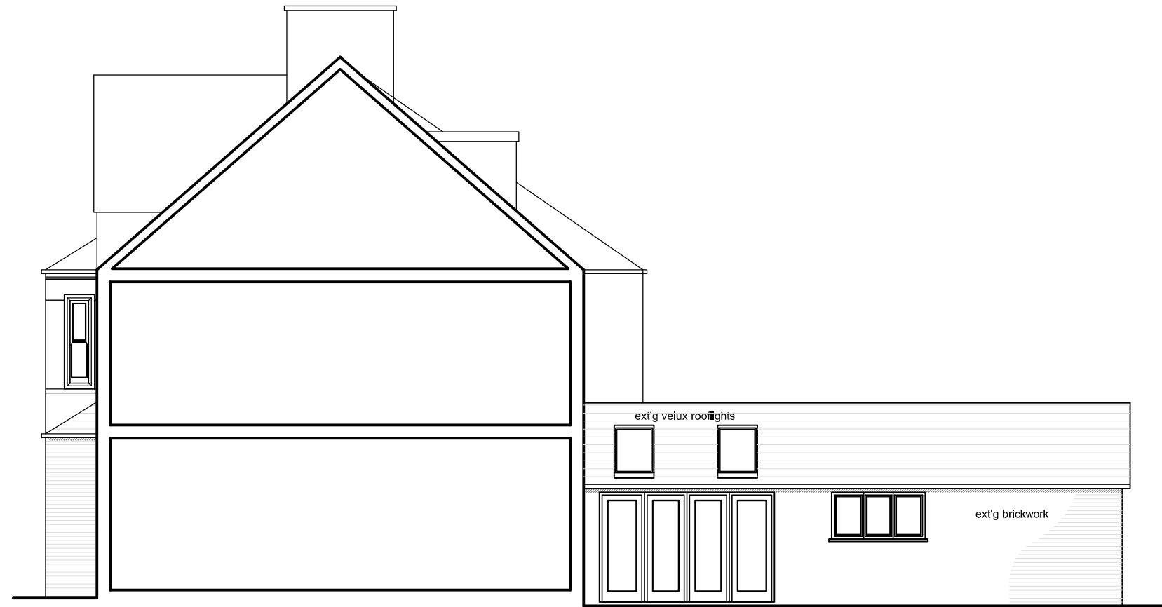
Existing Sectional Side Elevation AA - 246 Iffley Road