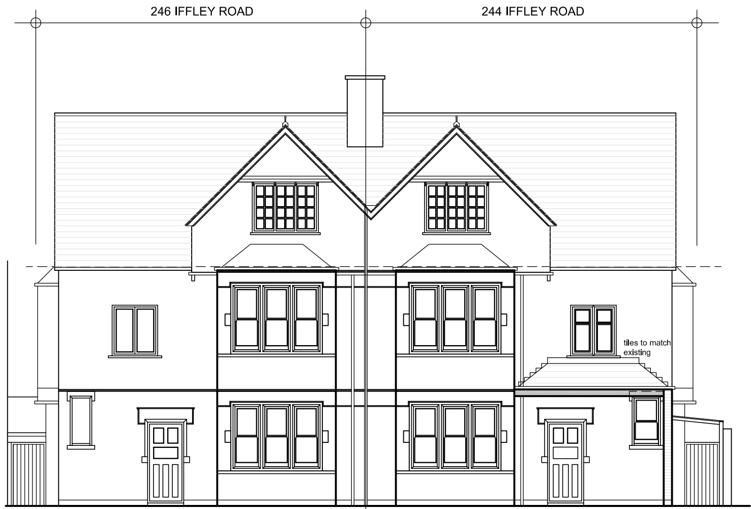
Existing Front Elevation - 244 & 246 Iffley Road