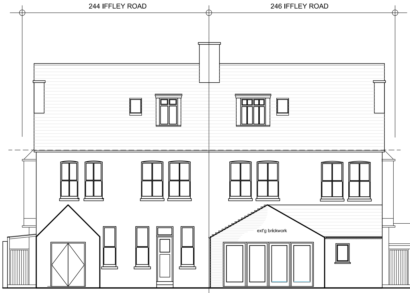
Existing Rear Elevation - 244 & 246 Iffley Road

This drawing and design is for use solely in connection with the project described below. The drawing and design is the copyright of MEB Design and must not be reissued, loaned or copied without written consent.