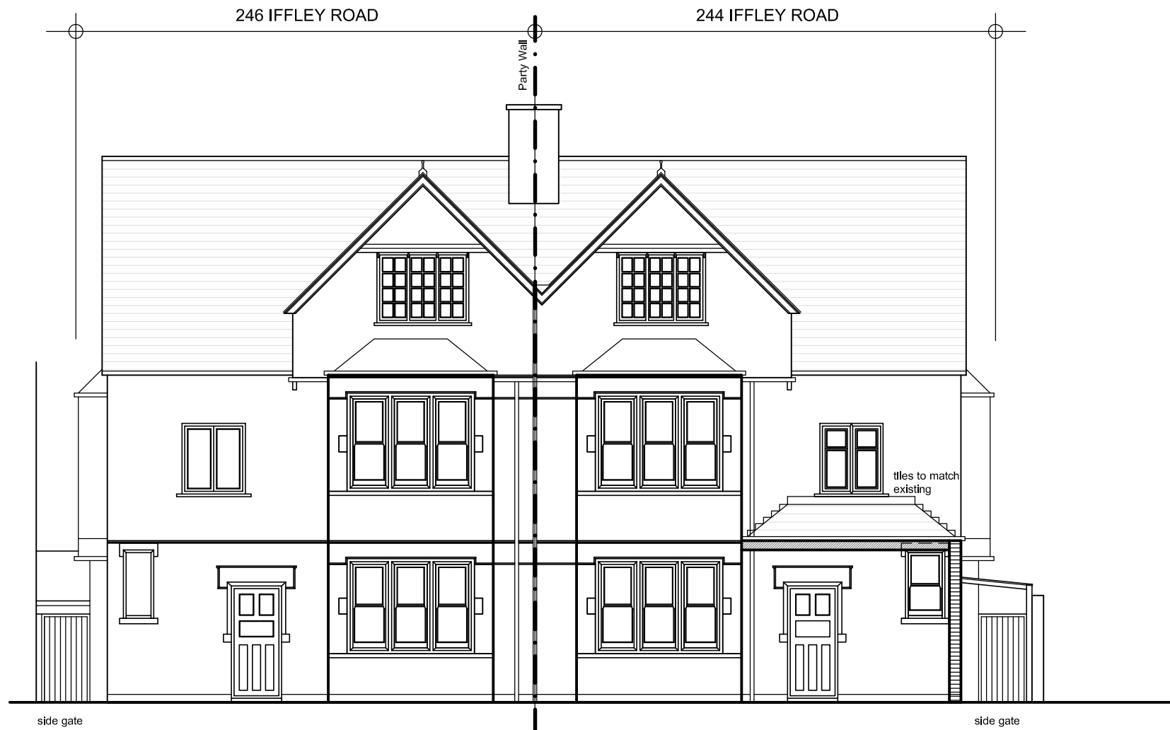
Proposed Front Elevation - 244 & 246 Iffley Road