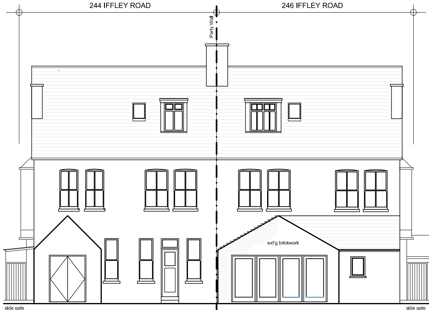
Proposed Rear Elevation - 244 & 246 Iffley Road

This drawing and design is for use solely in connection with the project described below. The drawing and design is the copyright of MEB Design and must not be reissued, loaned or copied without written consent.