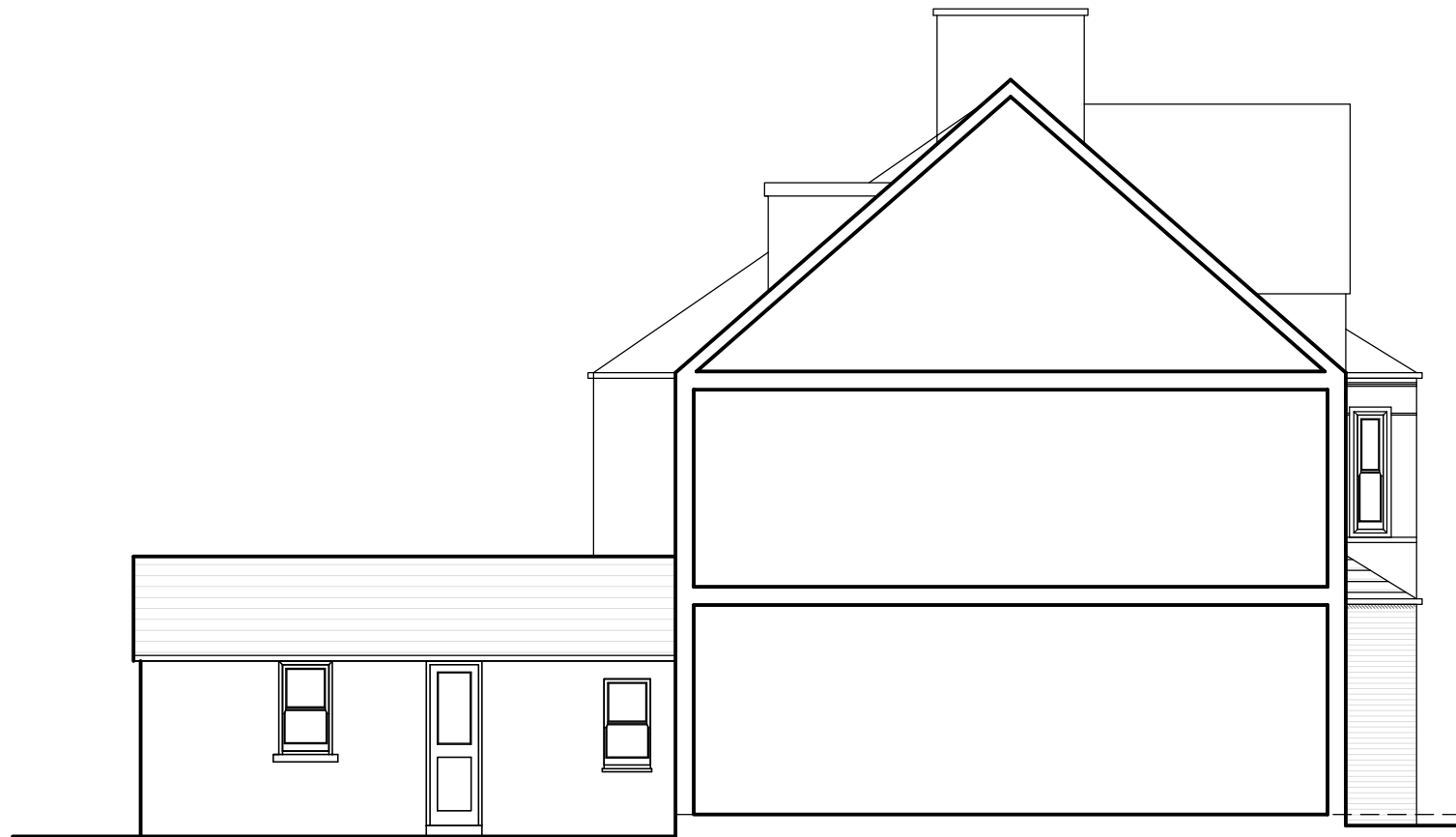
Existing Sectional Side Elevation BB - 244 Iffley Rd.