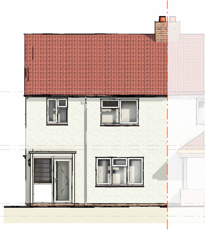
FE EX. FRONT ELEVATION SCALE 1 : 100