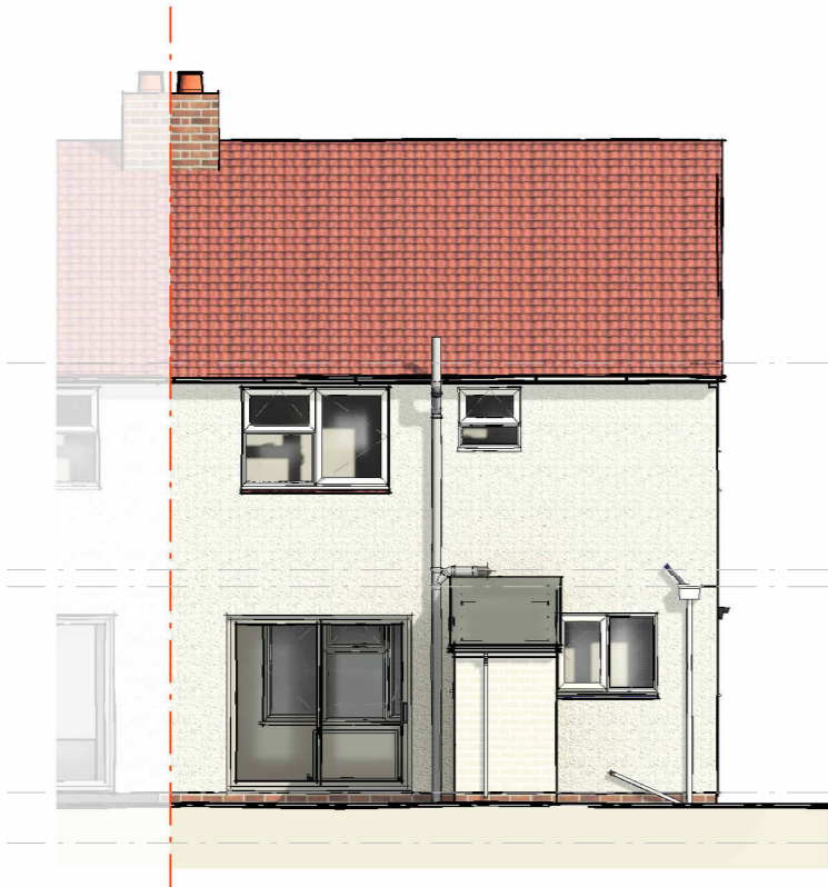
RE EX. REAR ELEVATION SCALE 1 : 100