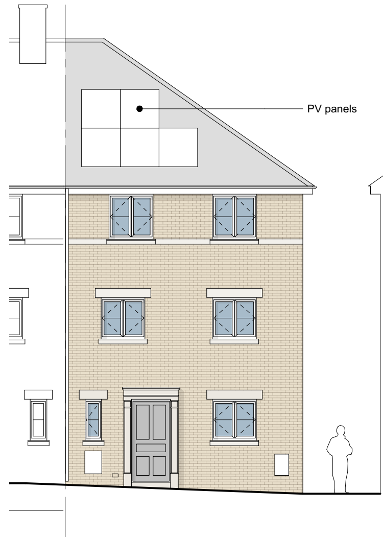
2 Proposed East elevation Scale: 1:100