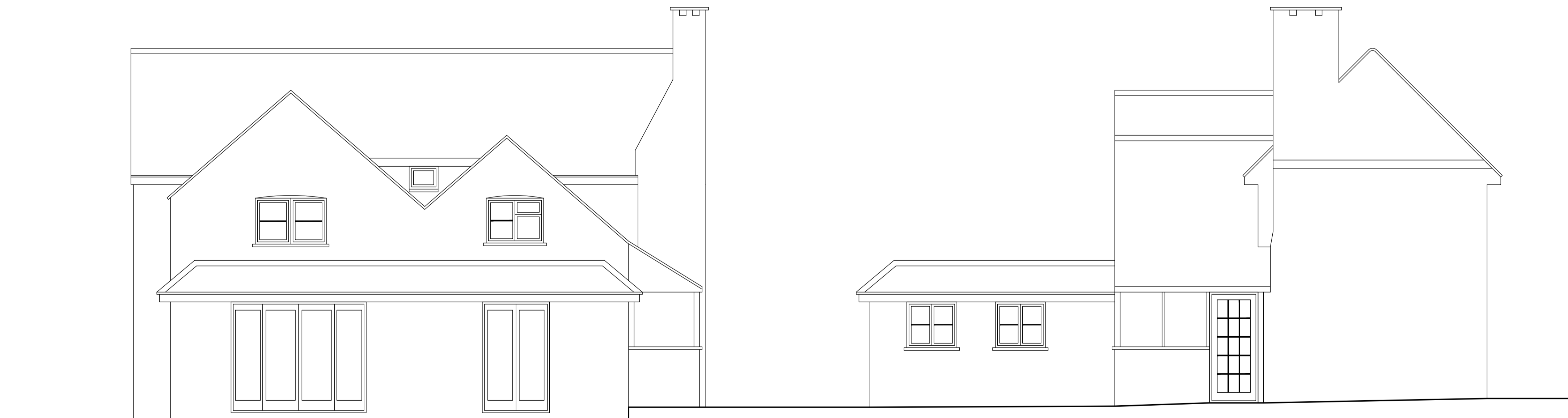
REAR ELEVATION (north facing)