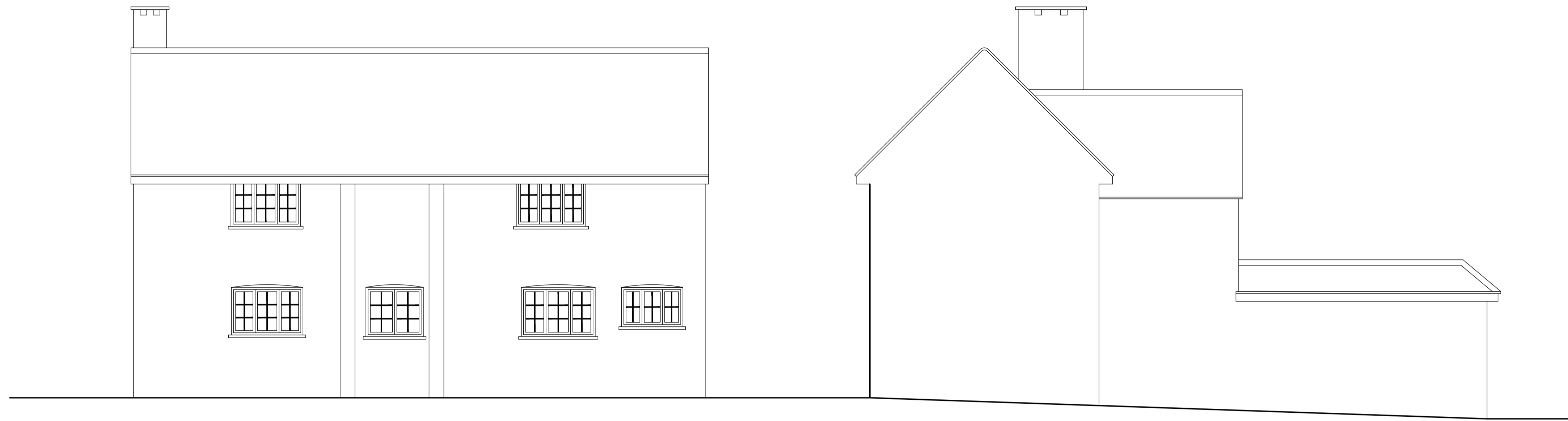
FRONT ELEVATION (south facing)