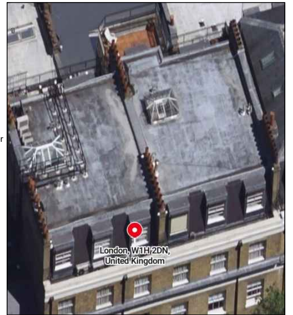
Existing roof photo from the front