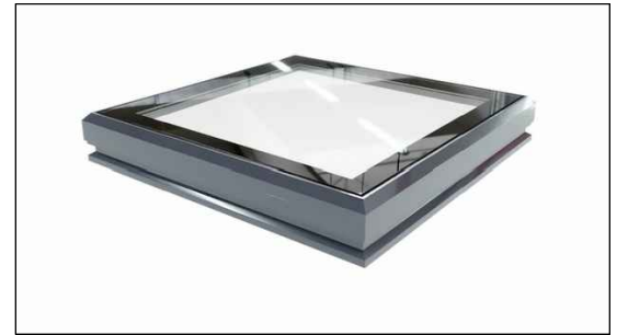
Proposed new skylight type