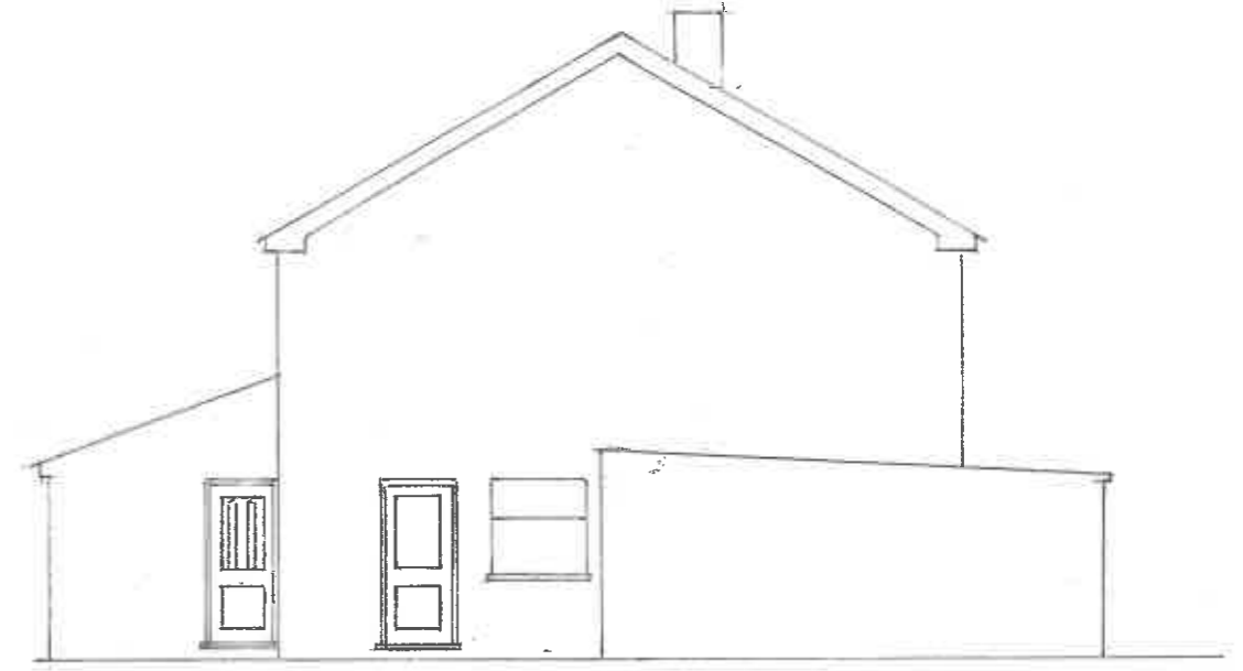
SOUTH ELEVATION: (Scale - 1:100 @ A.3)