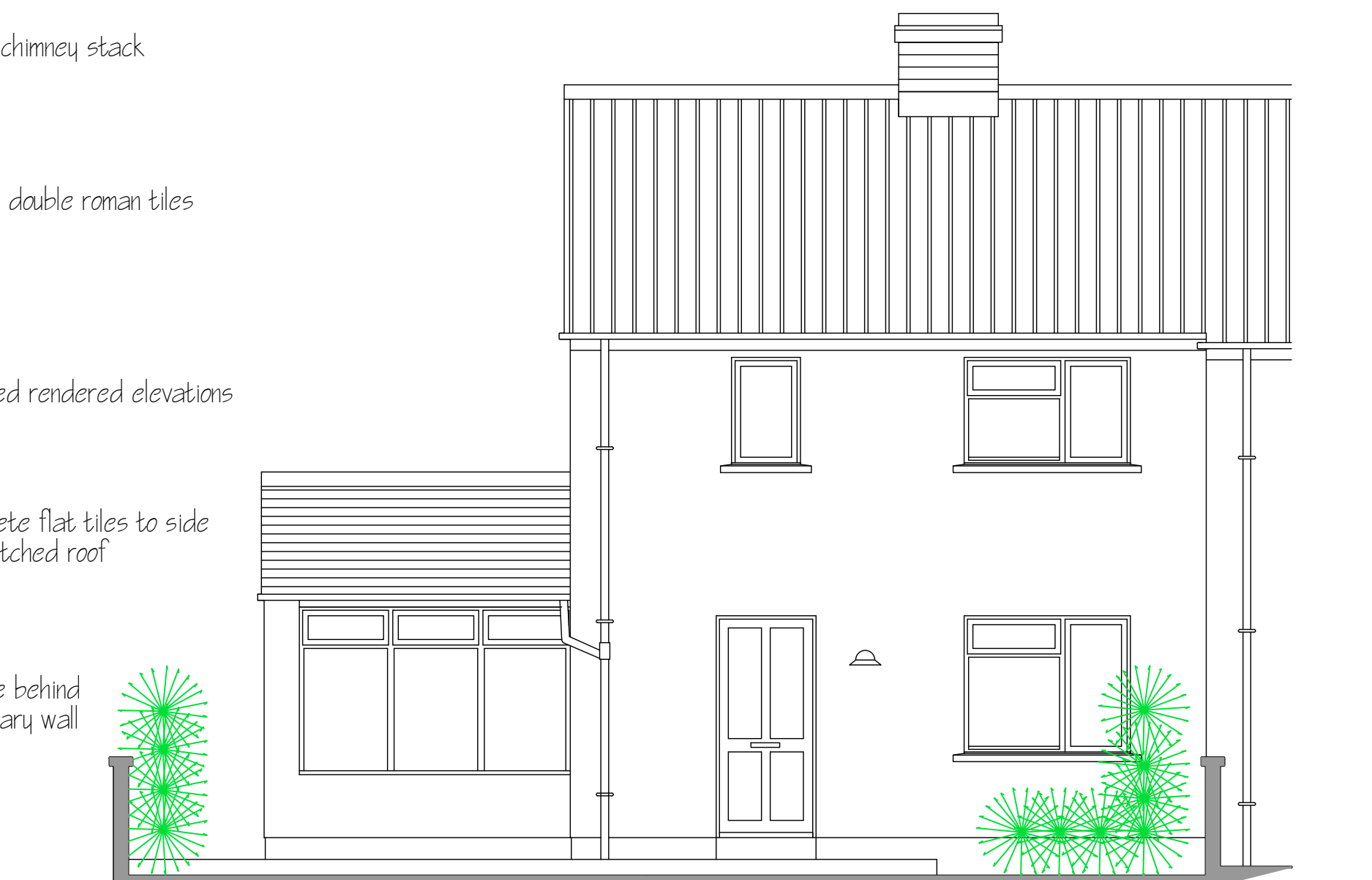
front (west) elevation as existing - 1:50