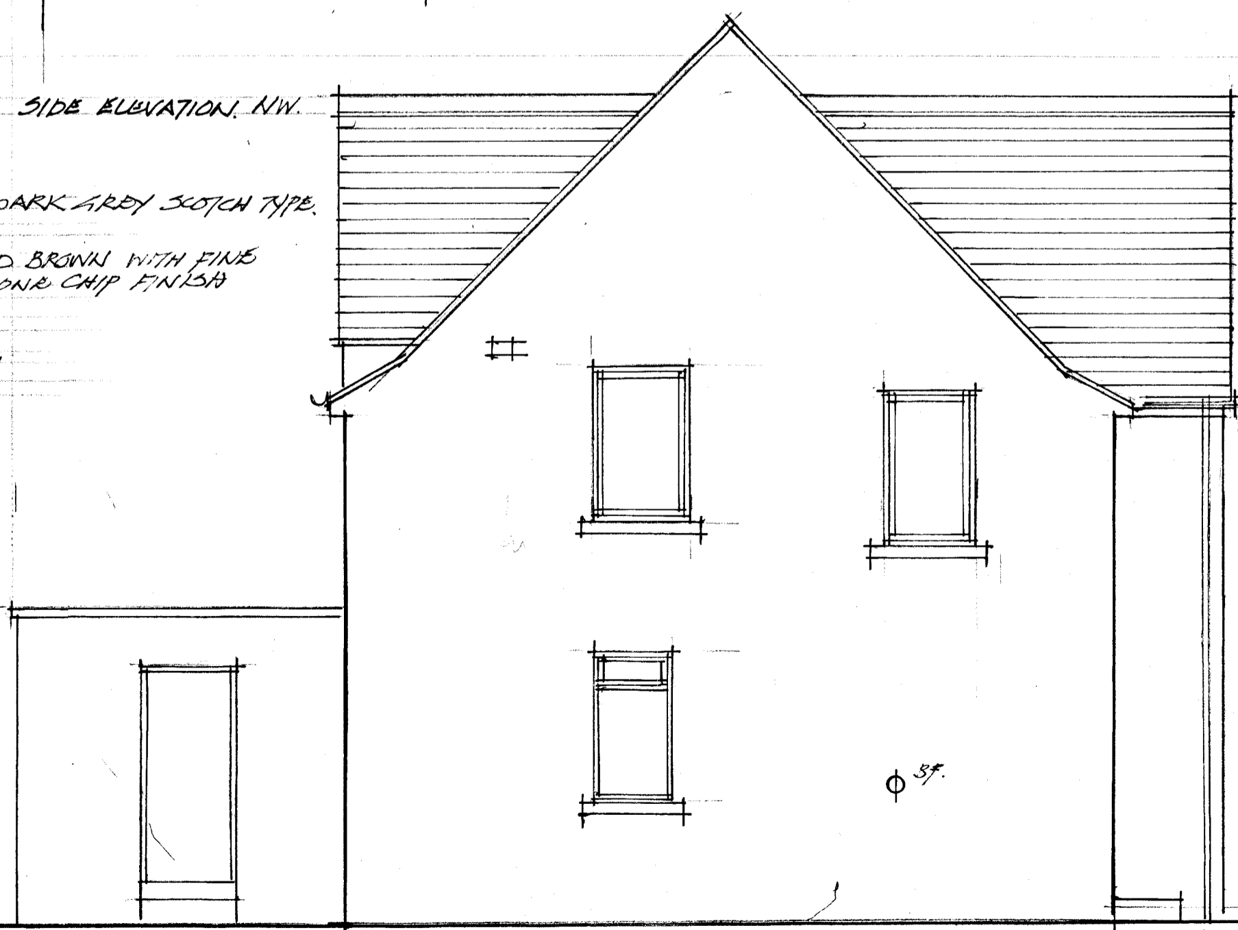
SIDE ELEVATION, N.W.

PITCHED ROOF : SLATES : DARK GREY SCOTCH TYPE. SOLIDWALLS : R/CAST : MID BROWN WITH FINE STONE CHIP FINISH WINDOW : WHITE UPVC. CEMENT FACED TO OPENING UPVC RW GOODS.