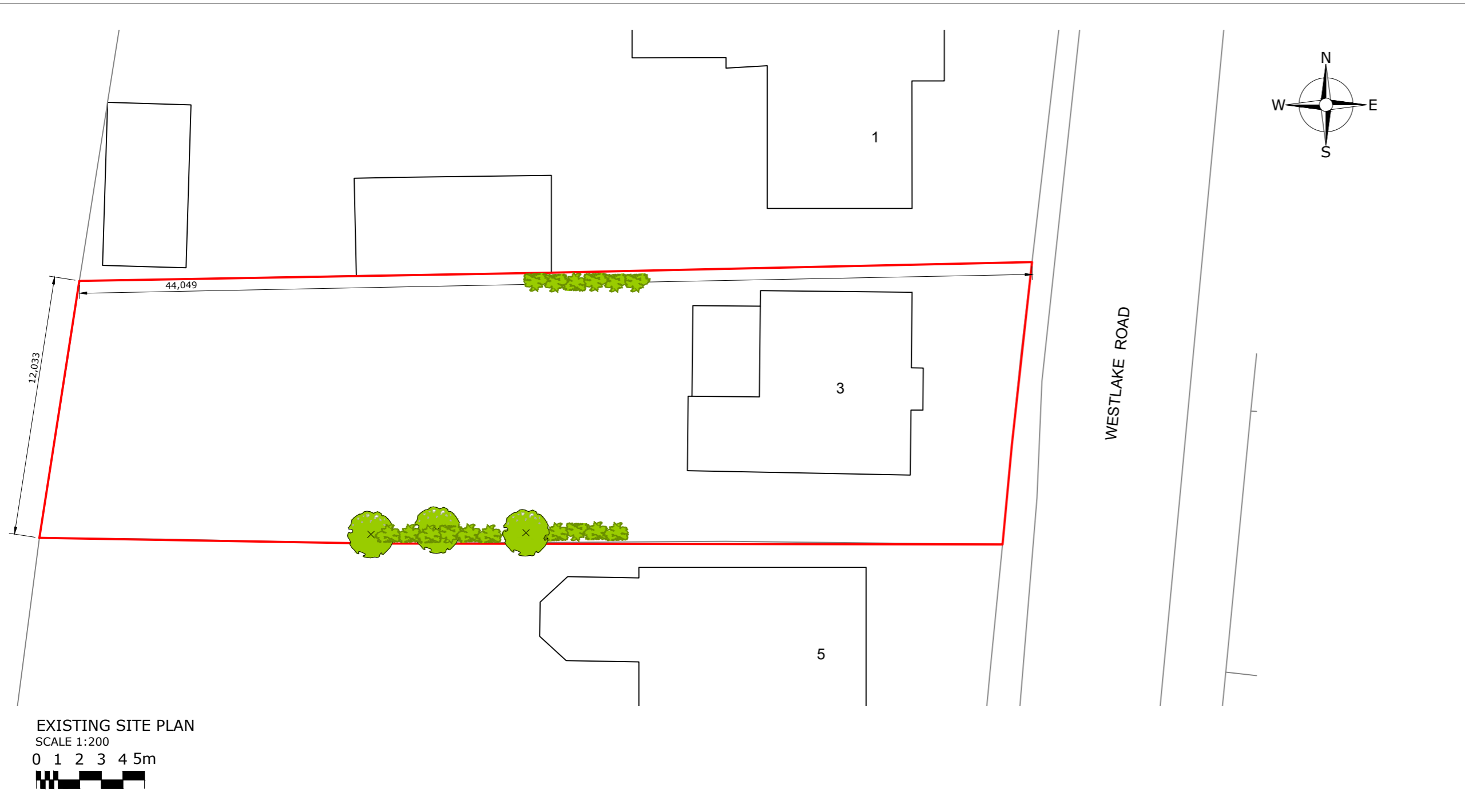
EXISTING SITE PLAN SCALE 1:200 0 1 2 3 4 5m