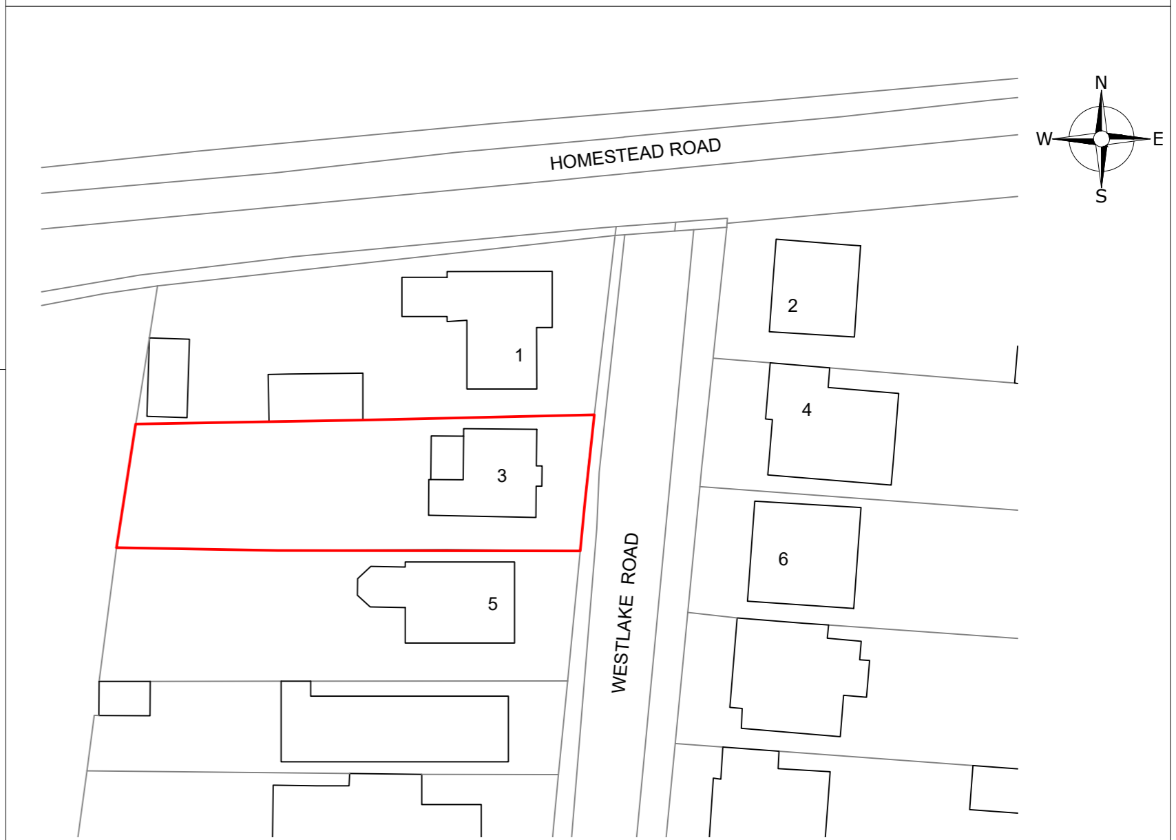
BLOCK PLAN SCALE 1:500 0 5 10 15 20m