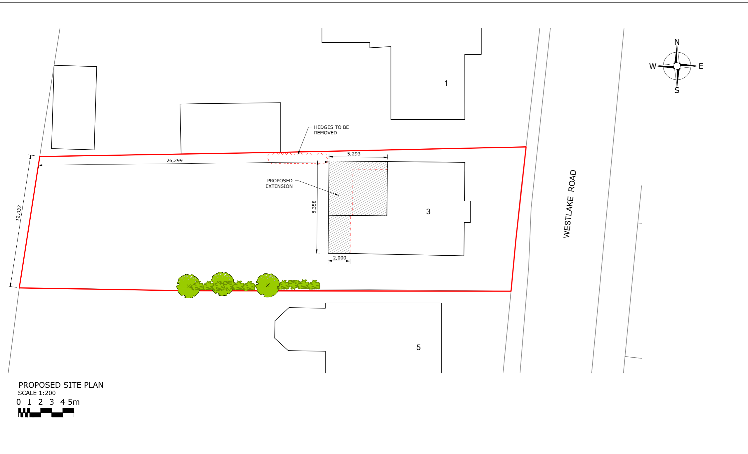
PROPOSED SITE PLAN SCALE 1:200 0 1 2 3 4 5m