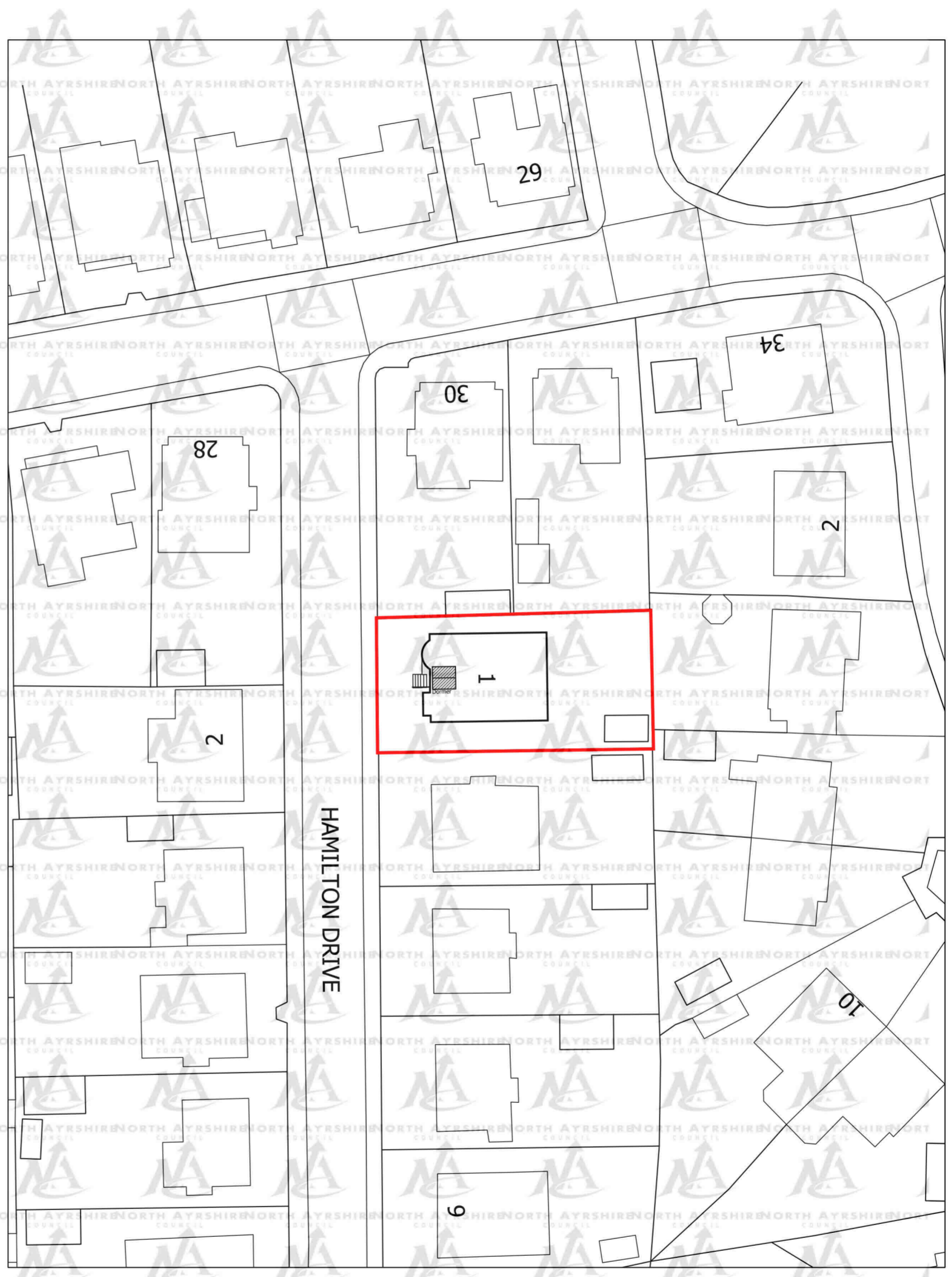
Existing Site Plan