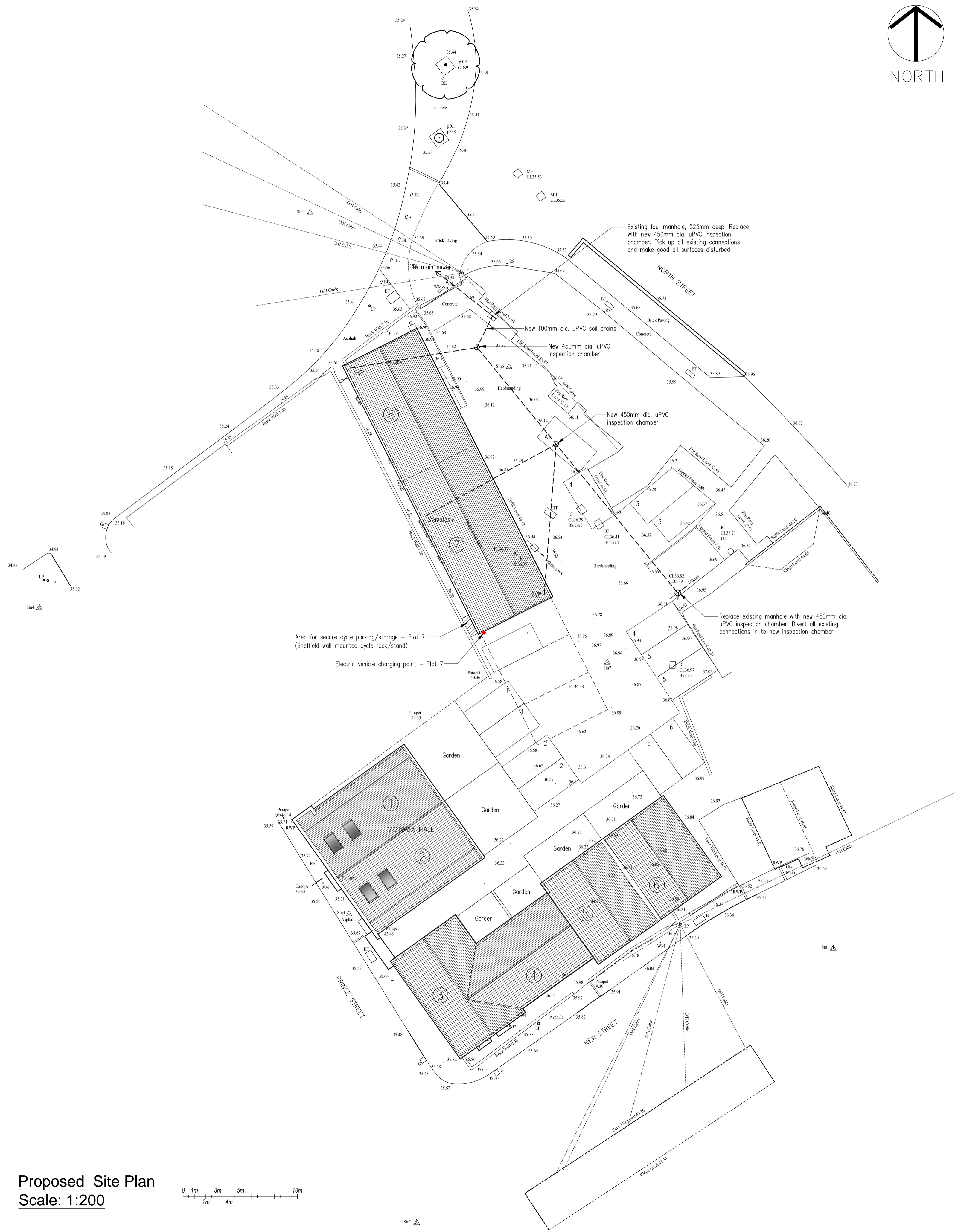
Proposed Site Plan Scale: 1:200